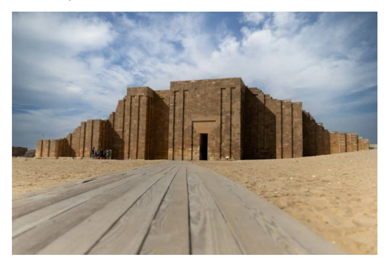
Giorno 2: Memphis , Sakkara , Pyramids Tour