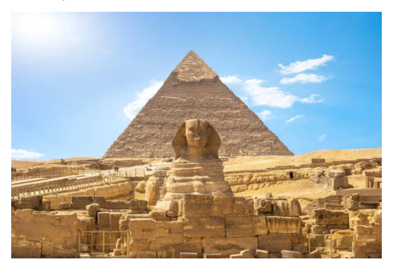
Giorno 2: Memphis, Sakkara, Pyramids tour.