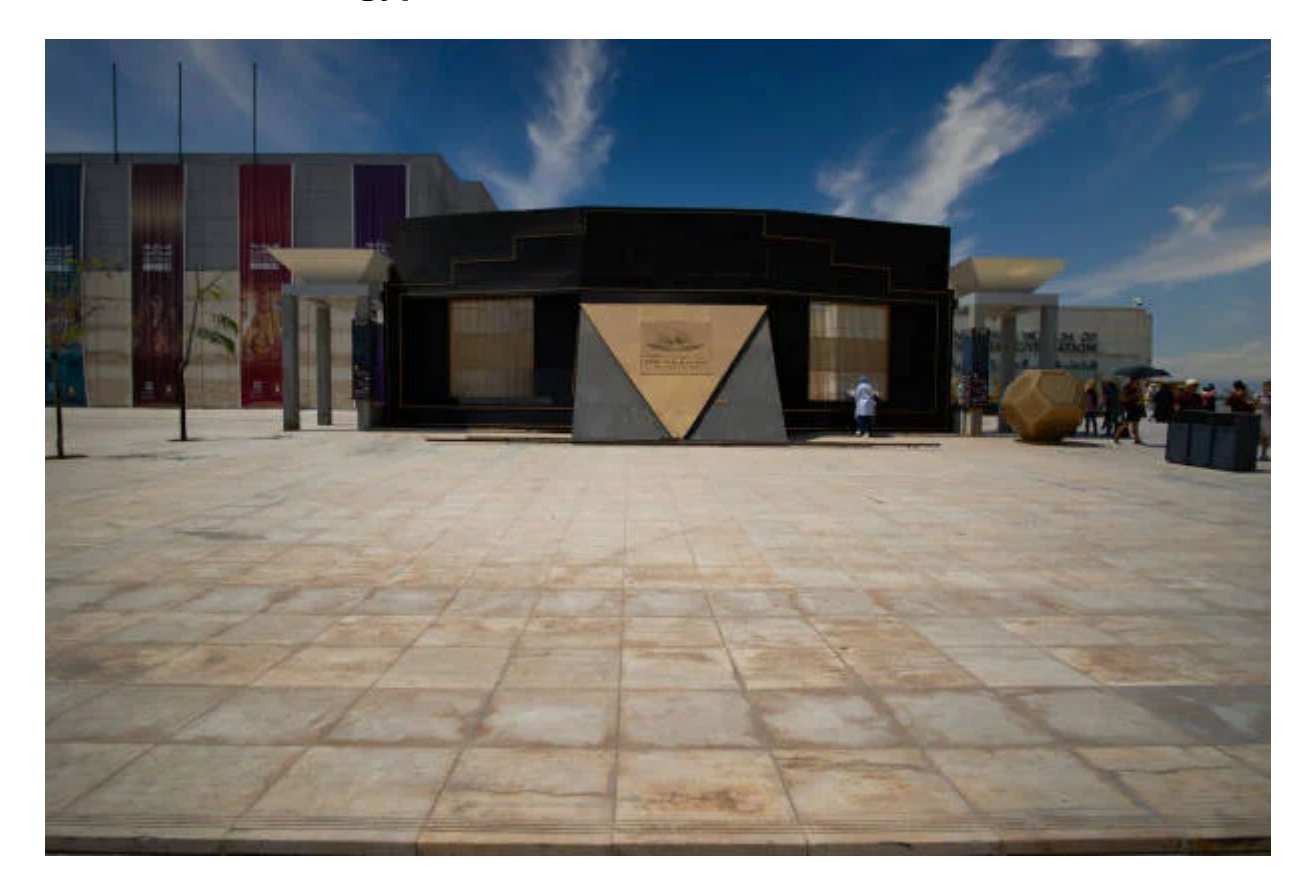
Giorno 7: Fly back to Cairo , National Egyptian Museum , Khan El Khalili