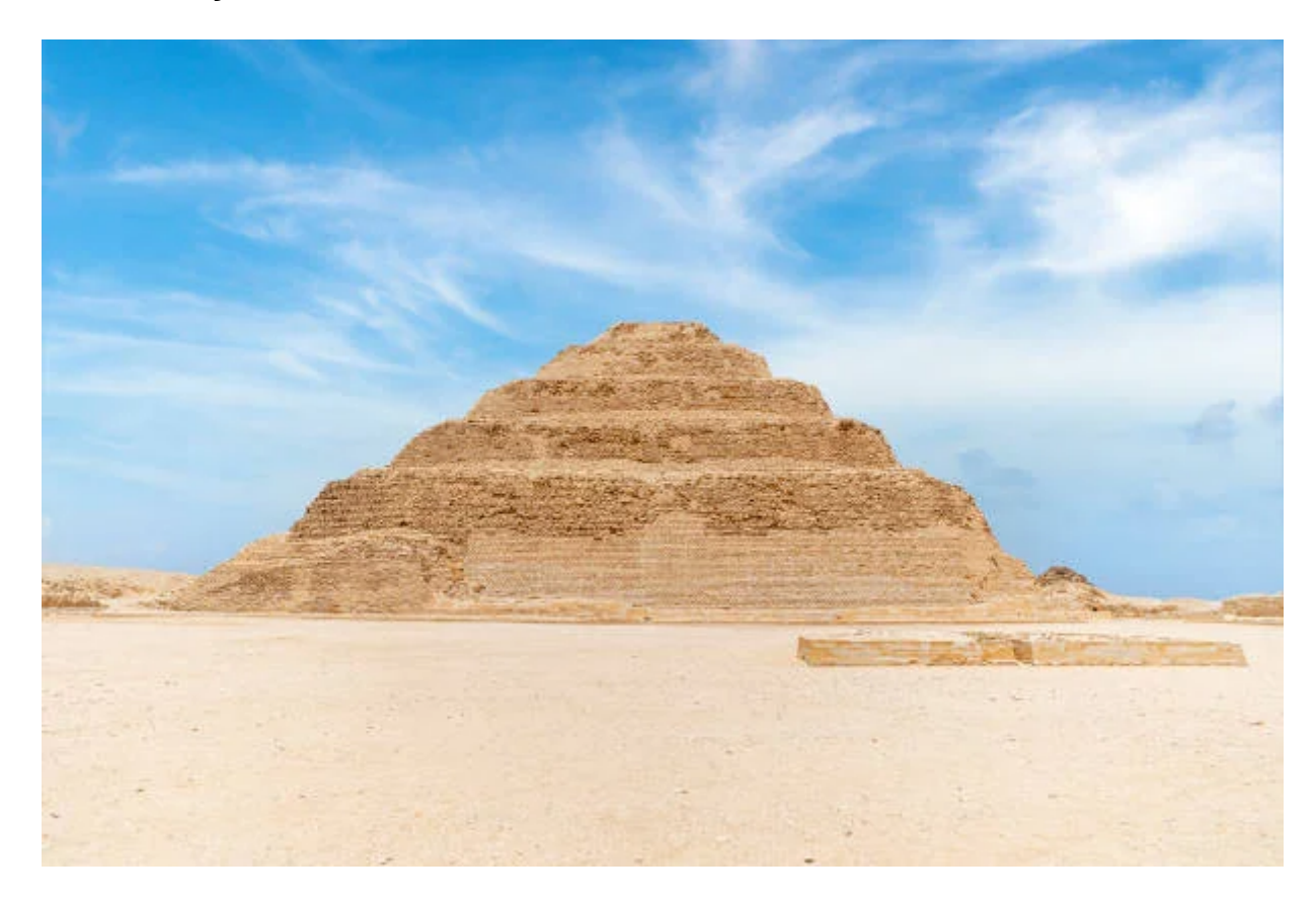
Giorno 9: Memphis, Sakkara, Pyramids tour

Our tour will make your holiday special because you are going to get inside new adventure in the land of Pyramids . we will start our journey with Aswan and see the unique people of Aswan and visit the great dam " High Dam " of Aswan and visit " The Unfinished Obelisk ", also we will visit the incurable " Philae Temple " and start sailing on the Nile cruise, and visit more and more temples like Kom Ombo temple, Edfu temple, Hatshepsut temple, Valley of the kings temple, Luxor temple, Karnak temple. your adventure will turn to the amazing city; Sharm El-Sheikh city where you can find fun and chill out from anything and enjoy with your accommodation and the beach, our journey not end yet!