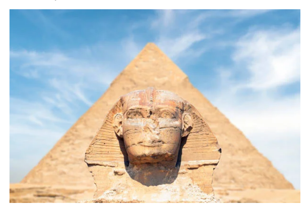
Giorno 2: Memphis , Sakkara , Pyramids Tour

Once you arrive at the airport, our representative will receive and welcome you. Then you will go with him to the Pyramids of Giza , Saqqara , and Memphis . The next day, you will go to the Egyptian Museum , and then you will go to Salah El- Din Citadel and Khan El Khalili Bazar .