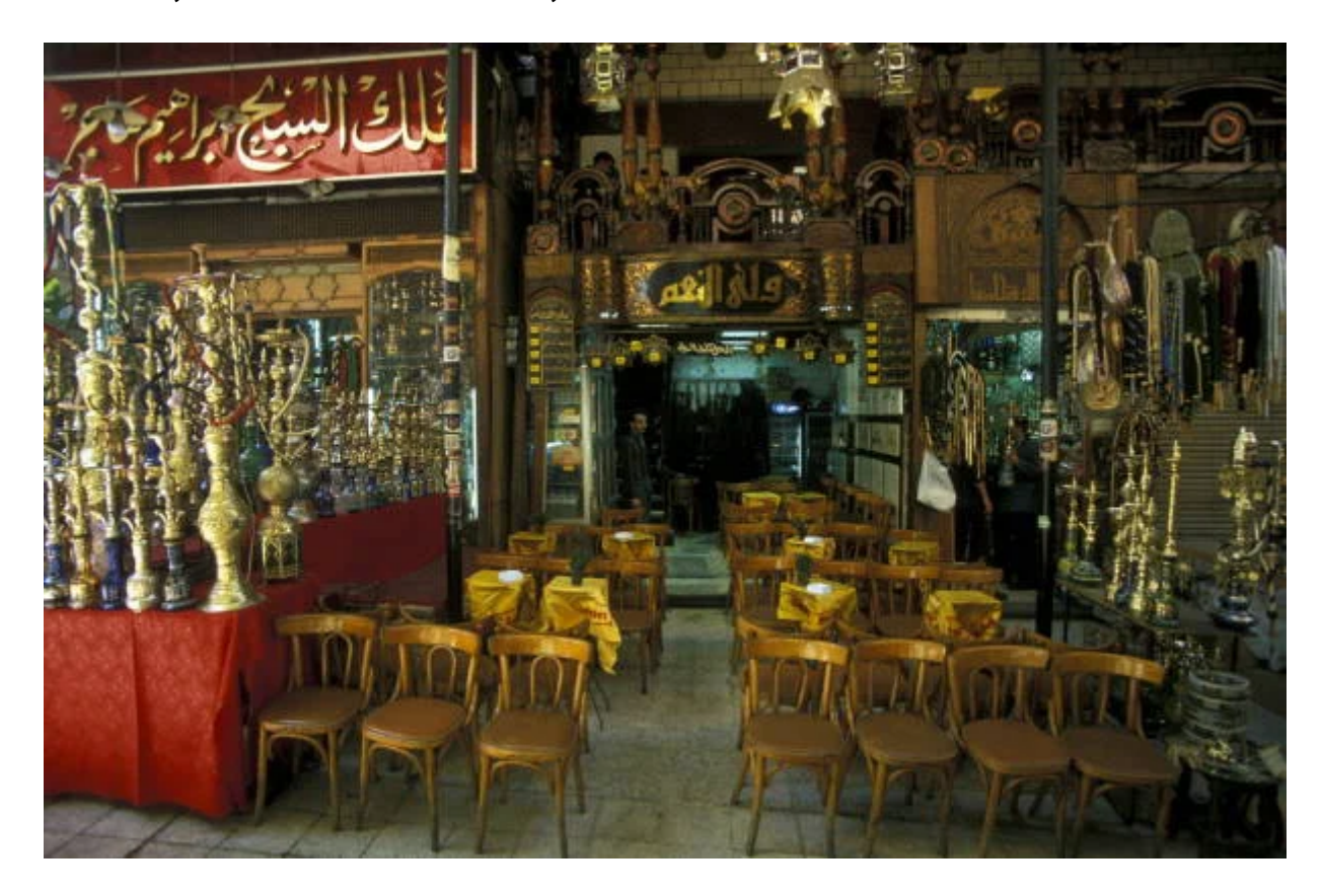
Giorno 3: Egyptian Museum ,Salah El Din Citadel , Khan El Khalili

Once you arrive at the airport, our representative will receive and welcome you. Then you will go with him to the Pyramids of Giza , Saqqara , and Memphis . The next day, you will go to the Egyptian Museum , and then you will go to Salah El- Din Citadel and Khan El Khalili Bazar .