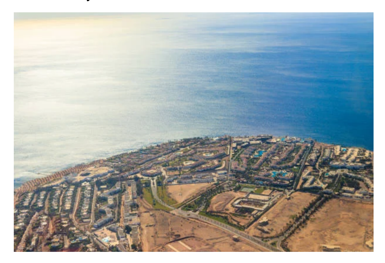
Giorno 2: Sharm El Sheikh - free day

Once you arrive at Cairo Airport, our representative will receive and welcome you, and then you will travel to Sharm El- Sheikh . When you arrive at the airport, our representative will be waiting for you. He will take you in an air-conditioned car to go to your hotel to relax.