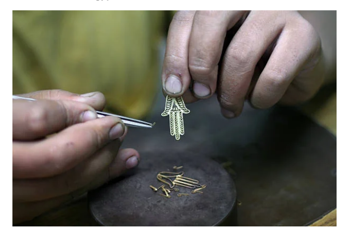
Giorno 7: Fly back to Cairo , National Egyptian Museum , Khan El Khalili