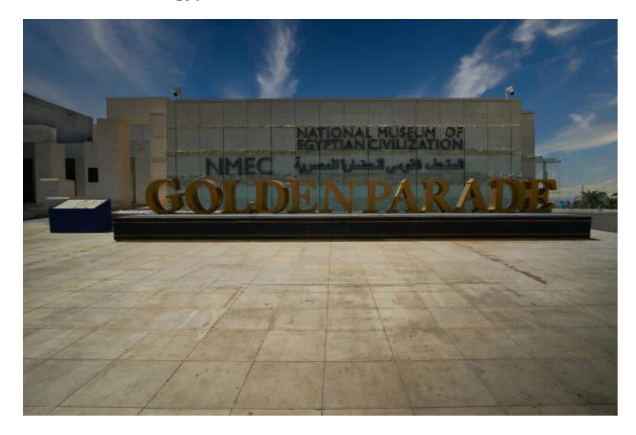
Giorno 6: Fly beck to Cairo, National Egyptian Civilization, Khan El Khalili

Our representative will receive you from the airport carrying a banner bearing your name. After welcoming you at the airport, he will take you to a hotel in Cairo. The next day, you will go to Marsa Alam and enjoy the beaches of Marsa Alam . You can do many activities. The next day, you will go on a safari tour with our representative, and after spending two days in... Marsa Alam You will continue the rest of your trip in Cairo. Your trip will begin by visiting the Egyptian Museum a nd, in the evening,