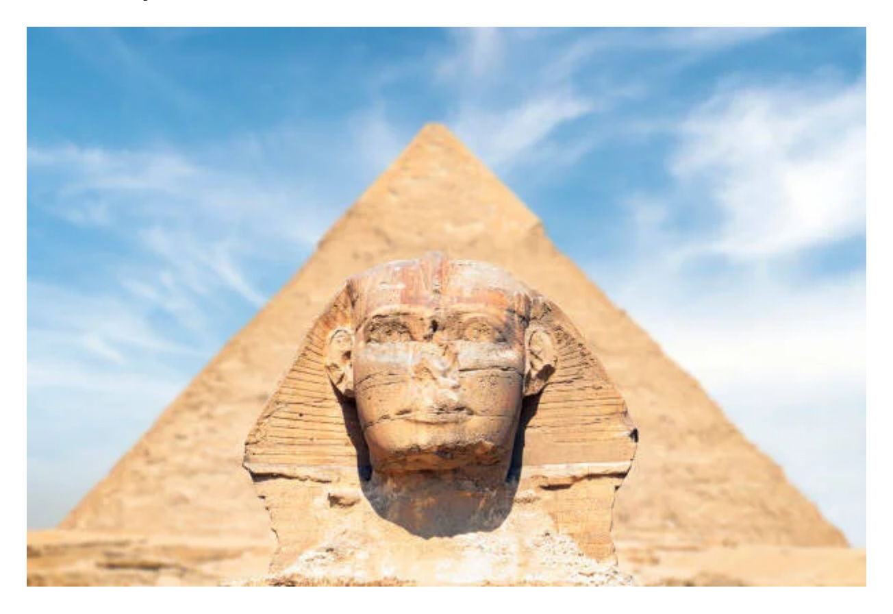
Giorno 7: Memphis, Sakkara, Pyramids Tour

Our representative will receive you from the airport carrying a banner bearing your name. After welcoming you at the airport, he will take you to a hotel in Cairo. The next day, you will go to Marsa Alam and enjoy the beaches of Marsa Alam . You can do many activities. The next day, you will go on a safari tour with our representative, and after spending two days in... Marsa Alam You will continue the rest of your trip in Cairo. Your trip will begin by visiting the Egyptian Museum a nd, in the evening,