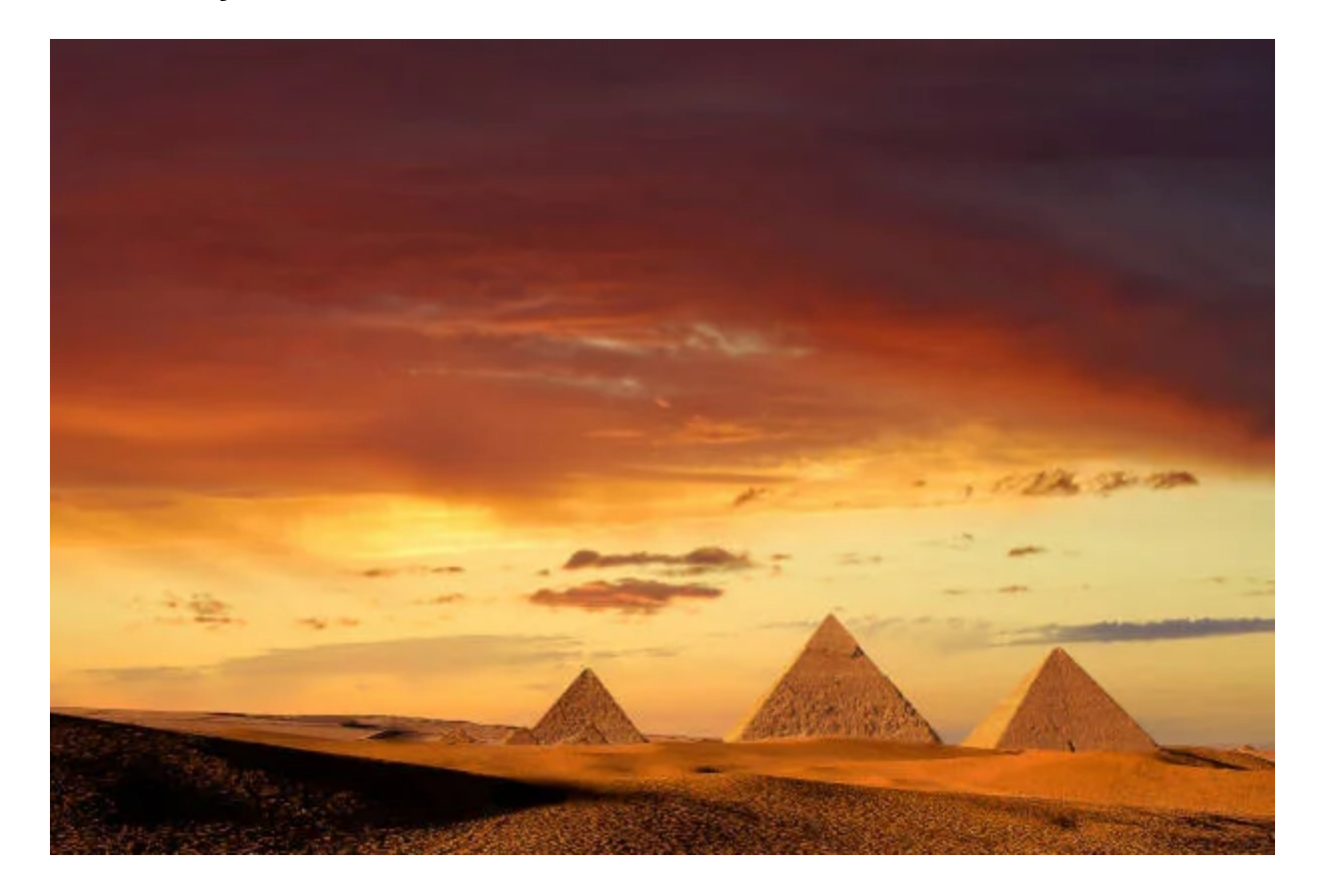
Giorno 7: Memphis, Sakkara, Pyramids Tour

Our representative will receive you from the airport carrying a banner bearing your name. After welcoming you at the airport, he will take you to a hotel in Cairo. The next day, you will go to Sharm El-Sheikh and enjoy the beaches of Sharm. You can do many activities. The next day, you will go on a safari tour with our representative, and after spending two days in Sharm. Sheikh, you will continue the rest of your trip in Cairo.