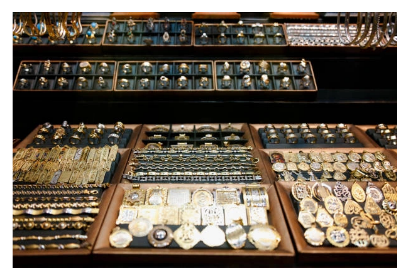
Giorno 8: Abu-Simbel, Fly back to Cairo, Khan El-Khalili Tour