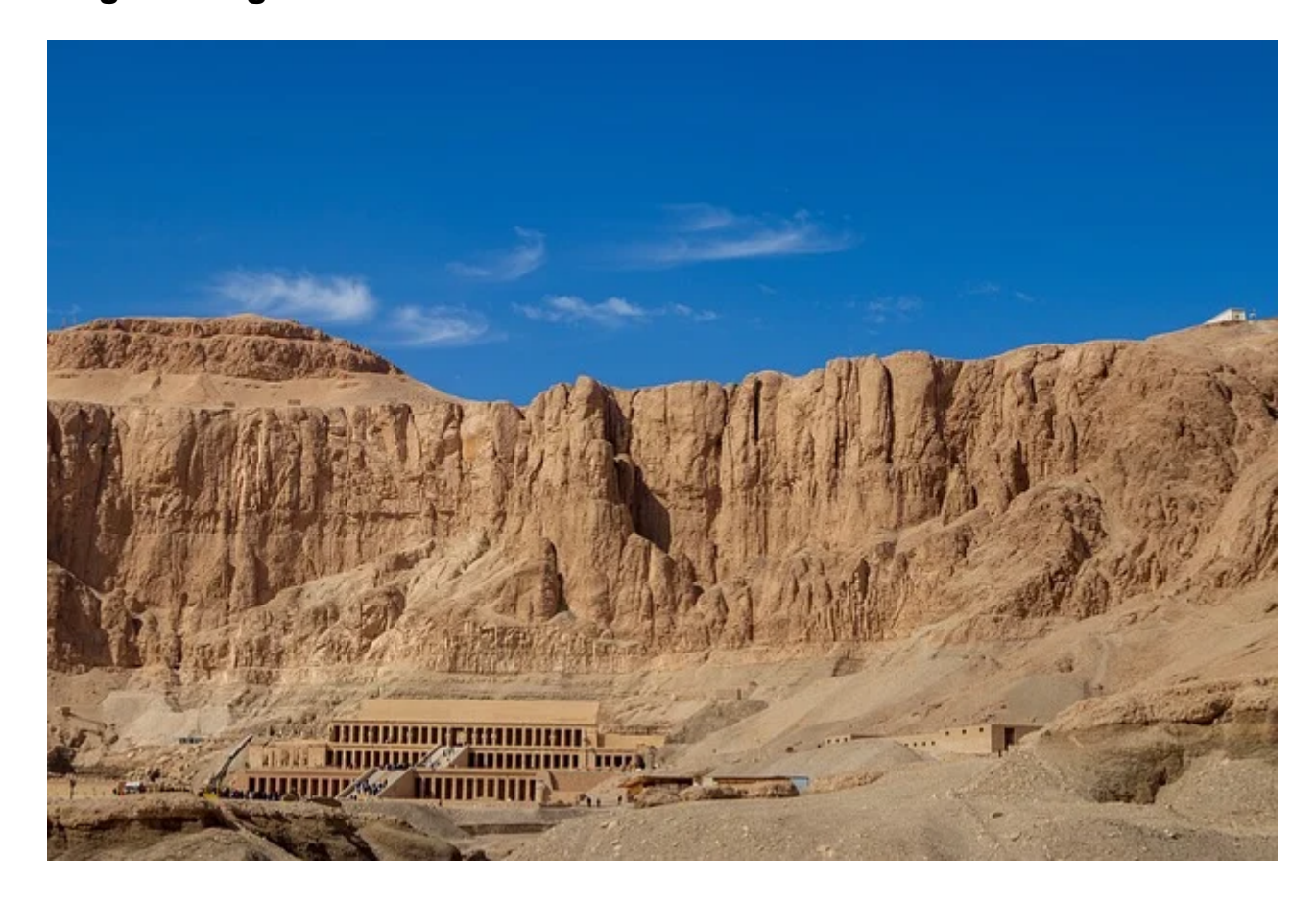
Giorno 5: West bank sightseeings