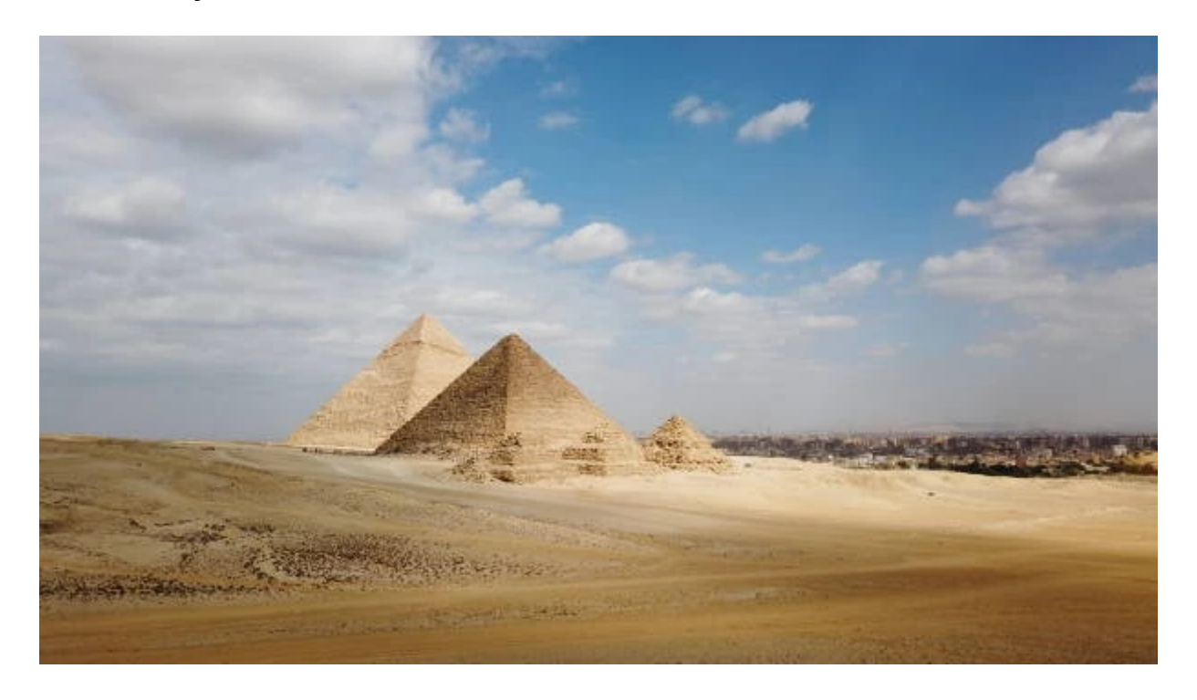
Giorno 2: Memphis, Sakkara, Pyramids Tour