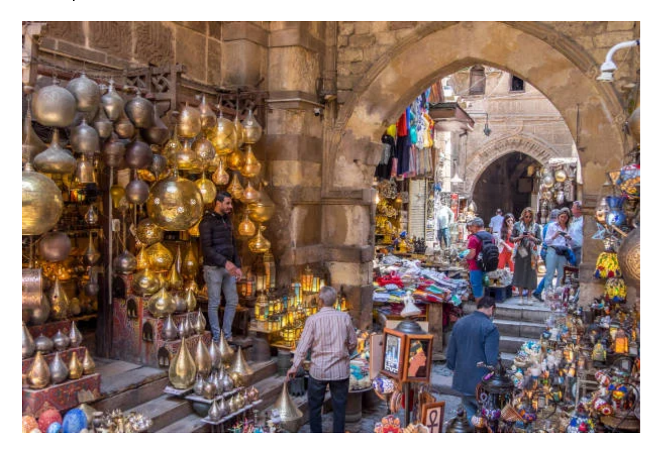
Giorno 8: Fly back to Cairo, Khan El Khalili