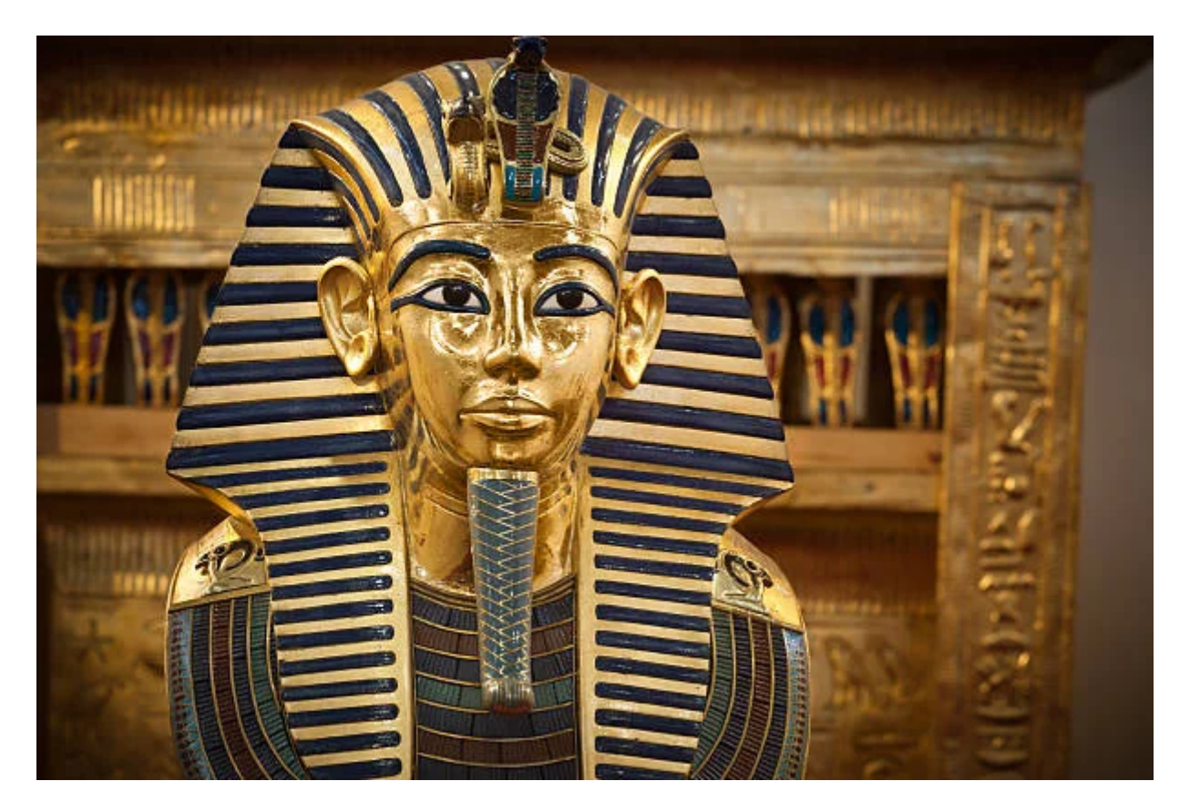
Giorno 3: Egyptian Museum , National Museum of Civilization , old Cairo

When you arrive at Cairo airport, our representative will take you to the hotel and the next day you will go to the Pyramids of Giza and then Saqqara and then Memphis and have lunch at a local restaurant the next day have breakfast at the hotel, our representative will take you to the National Museum of Civilization and then to the Egyptian Museum and then you will get acquainted with the Coptic civilization, where the Jewish Temple , The Hanging Church and Mary of Gergs and the next day you will go to Fayoum with our representative, who takes you on an interesting tour to the Village of Tunis to have breakfast,