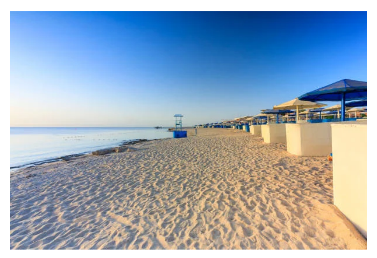
Giorno 5: Fly to Sharm El Sheikh

When you arrive at Cairo airport, our representative will take you to the hotel and the next day you will go to the Pyramids of Giza and then Saqqara and then Memphis and have lunch at a local restaurant the next day have breakfast at the hotel, our representative will take you to the National Museum of Civilization and then to the Egyptian Museum and then you will get acquainted with the Coptic civilization, where the Jewish Temple , The Hanging Church and Mary of Gergs and the next day you will go to Fayoum with our representative, who takes you on an interesting tour to the Village of Tunis to have breakfast,