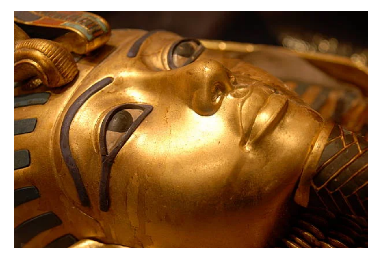
Giorno 3: Egyptian Museum , National Museum of Civilization , old Cairo

When you arrive at Cairo airport, our representative will take you to the hotel and the next day you will go to the Pyramids of Giza and then Saqqara and then Memphis and have lunch at a local restaurant the next day have breakfast at the hotel, our representative will take you to the National Museum of Civilization and then to the Egyptian Museum and then you will get acquainted with the Coptic civilization, where the Jewish Temple , The Hanging Church and Mary of Gergs and the next day you will go to Fayoum with our representative, who takes you on an interesting tour to the village of Tunis to have breakfast,