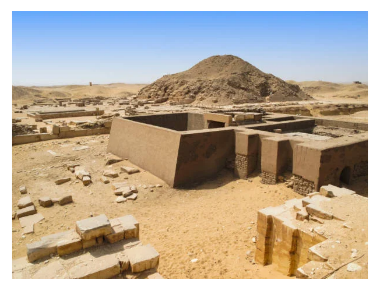
Giorno 2: Memphis , Sakkara , Pyramids Tour