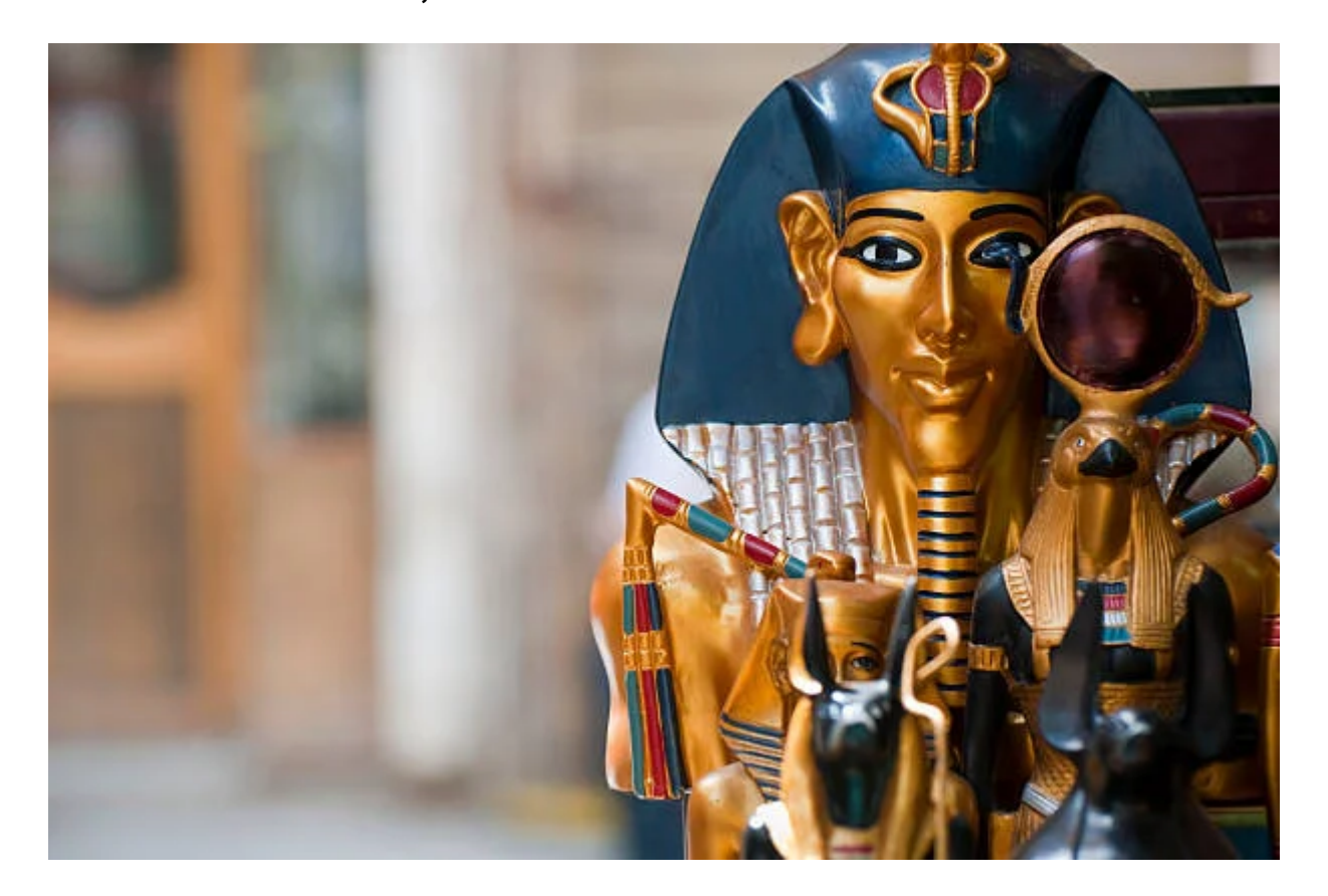
Giorno 7: National Museum of Civilization, khan el-khalili

you will go on a four-hour trip into the white desert on After about 350 km, you will stop to have lunch and some refreshments, also known as the jewel of the desert, because it is a hill of crystal-like crystals where you can watch suitable exhilarating when the light hits it, then it