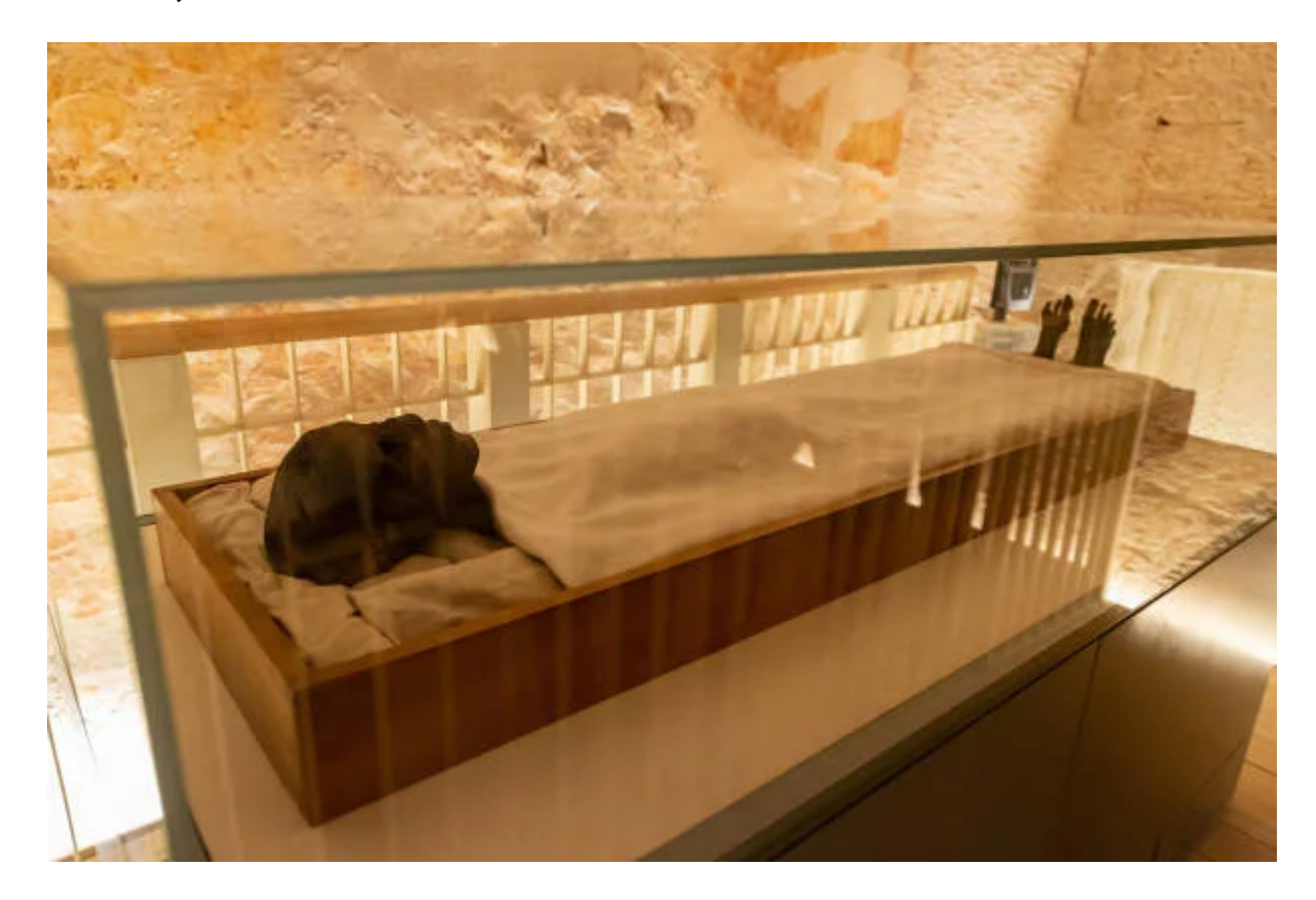
Giorno 3: Egyptian Museum, old Cairo

Our representatives will take you on an interesting free time tour of Cairo and visit the archaeological sites of Paris, where the Egyptian Museum includes a large collection of statues and antiquities.. We will also take you on a tour of the Pyramids , Memphis , Saqqara and the continent which you can enjoy on a tour of Coptic and Islamic antiquities,