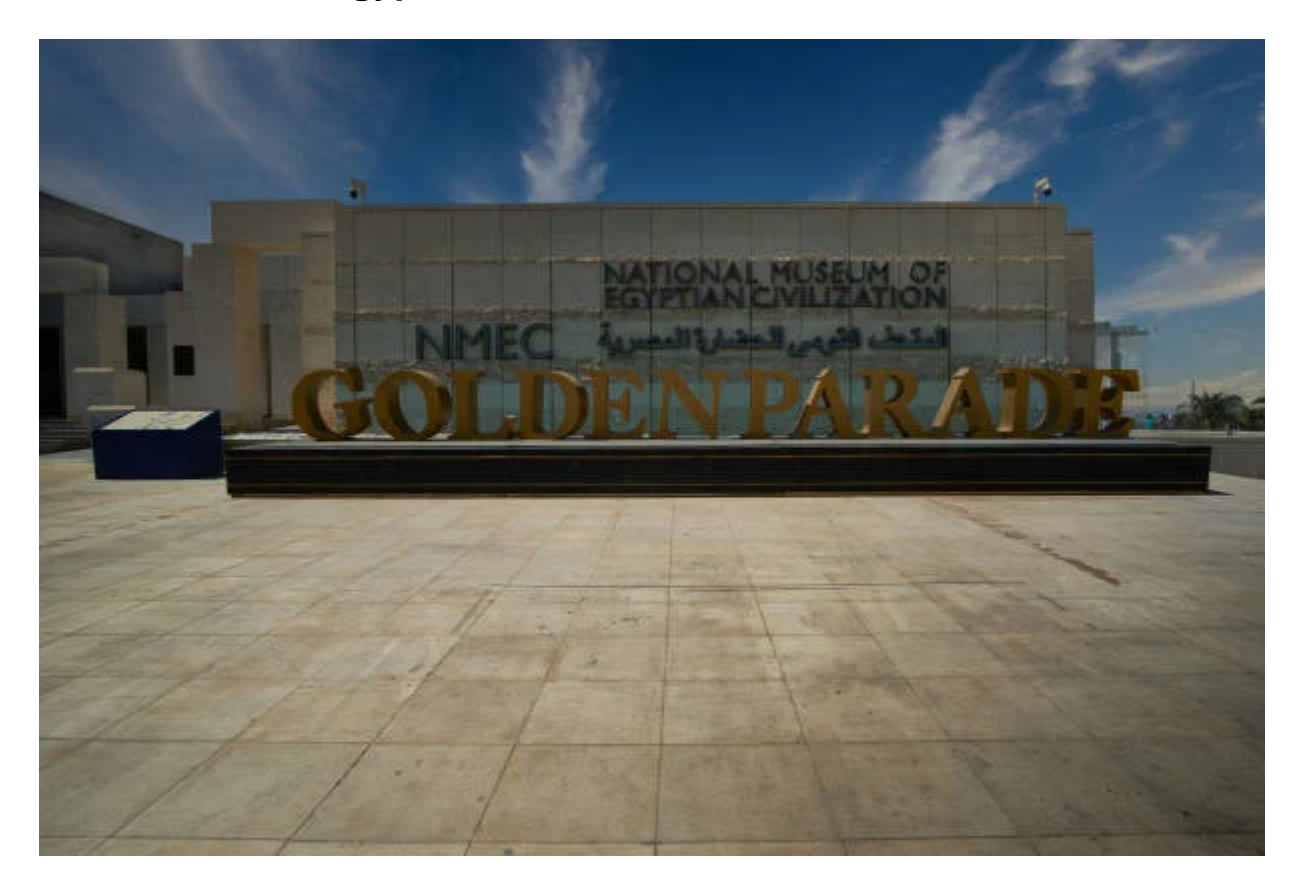
Giorno 7: Fly back to Cairo , National Egyptian Museum , Khan El Khalili

Our representatives will take you on an interesting free time tour of Cairo and visit the archaeological sites of Paris, where the Egyptian Museum includes a large collection of statues and antiquities.. We will also take you on a tour of the Pyramids , Memphis , Saqqara and the continent which you can enjoy on a tour of Coptic and Islamic antiquities,