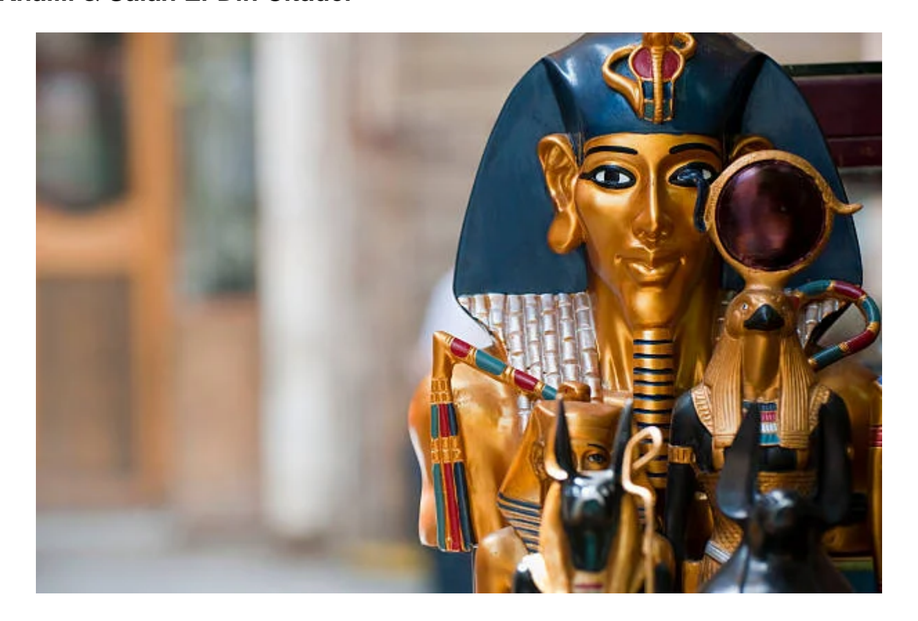
Giorno 5: Khan el-Khalili & Salah El-Din Citadel