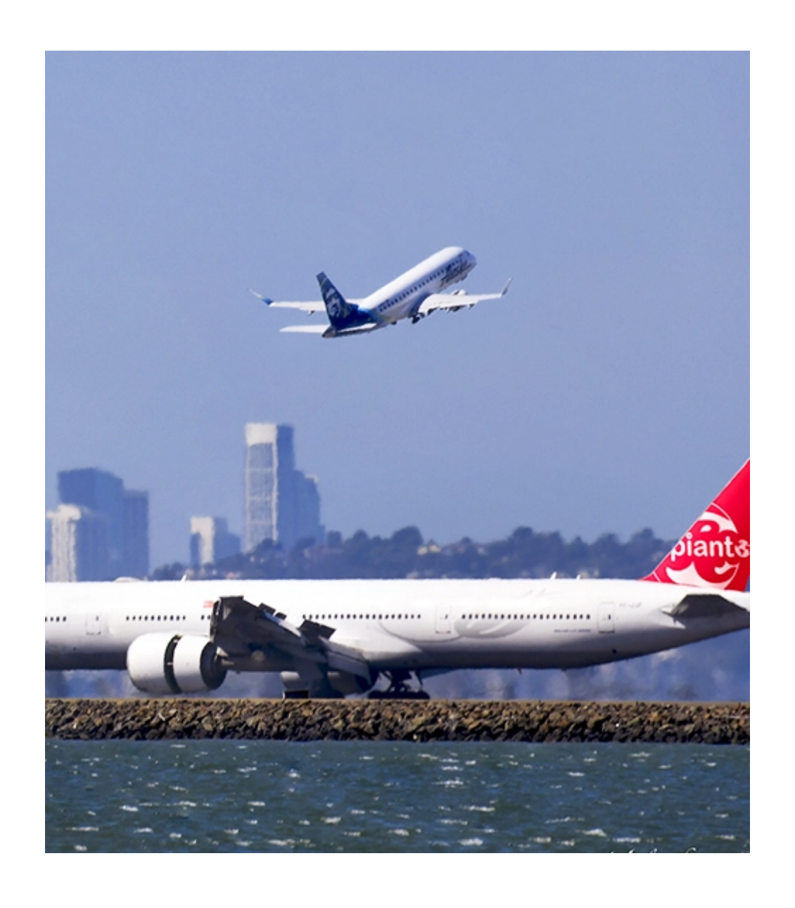
Giorno 5: Depature