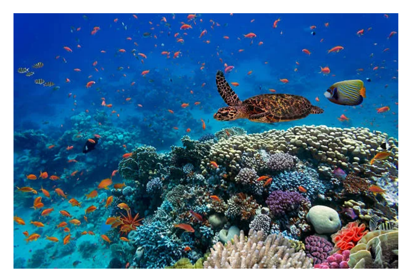
Giorno 4: Fly to Marsa Alam

then on to Marsa Alam to spend some lovely relaxing time by the Sea Mediterranean.. When the skies are clear, you can enjoy many activities, including water skiing, diving, dolphin watching and more When you return to Cairo,