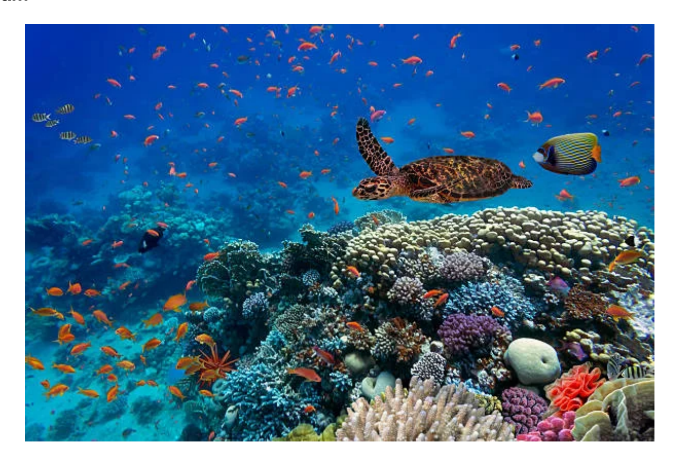
Giorno 6: Marsa Alam