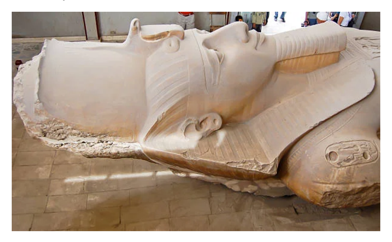
Giorno 2: Memphis, Sakkara, Pyramids Tour