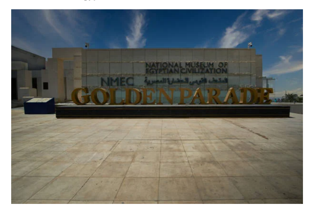
Giorno 7: Fly back to Cairo, National Egyptian Civilization, Khan El Khalili