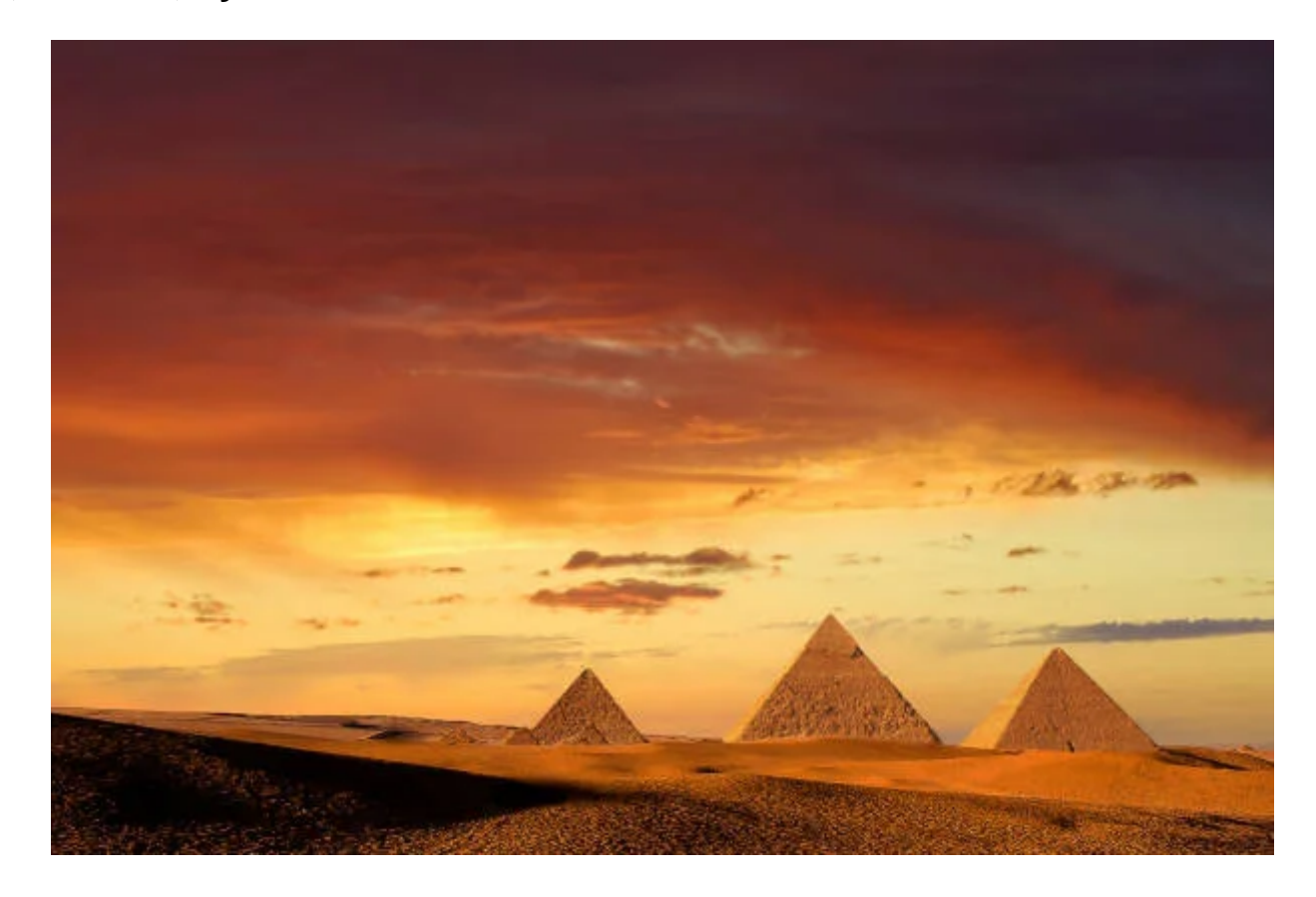
Giorno 2: Memphis, Sakkara, Pyramids Tour

the next day you will go to Alexandria we will take you to the Citadel of Qaitbay and then to Kom el-shukafa and the Pompey's Pillar that was built of granite stone,