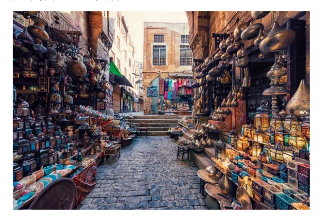
Giorno 6: Khan el-Khalili & Salah El-Din Citadel

the next day you will go to Alexandria we will take you to the Citadel of Qaitbay and then to Kom el-shukafa and the Pompey's Pillar that was built of granite stone,