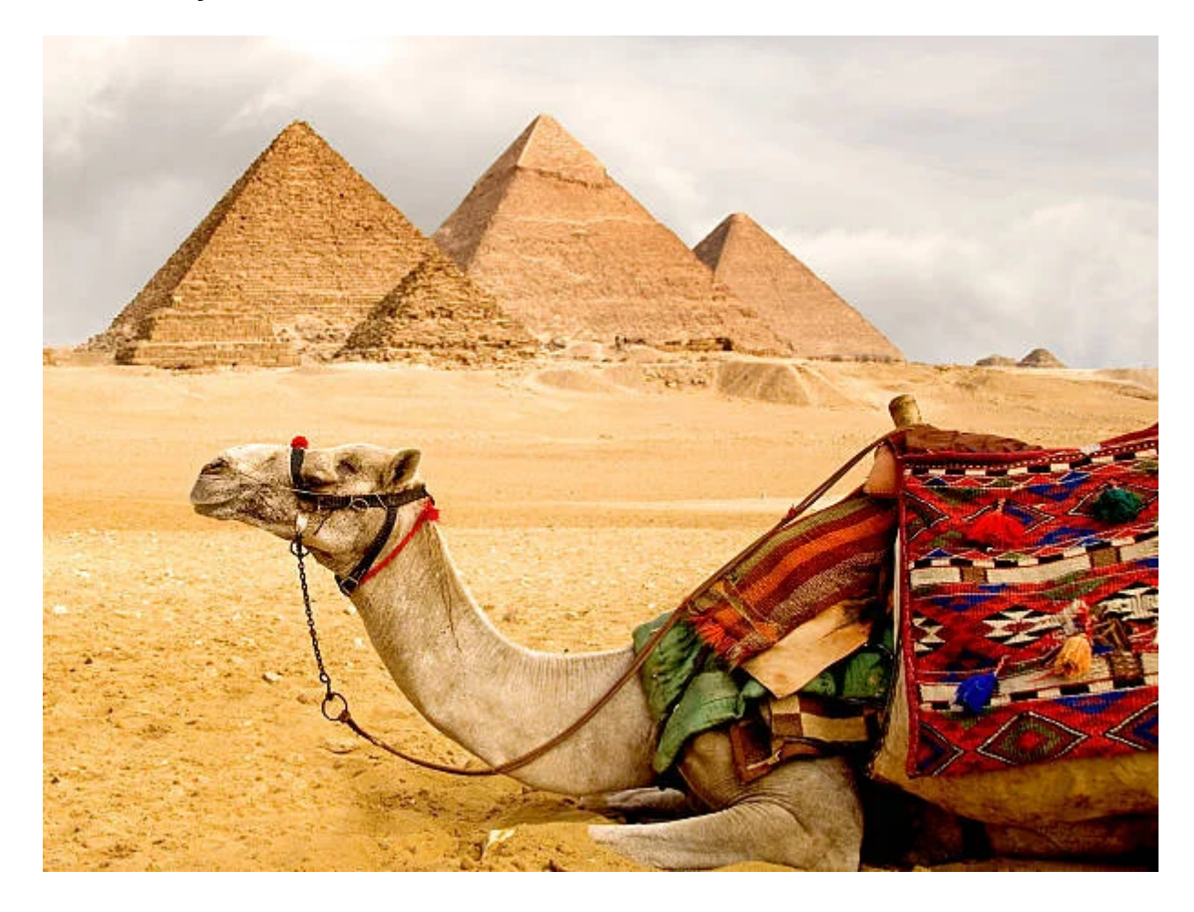
Giorno 2: Memphis, Sakkara, Pyramids Tour

the next day you will go to Alexandria we will take you to the Citadel of Qaitbay and then to Kom el-shukafa and the Pompey's Pillar that was built of granite stone ,