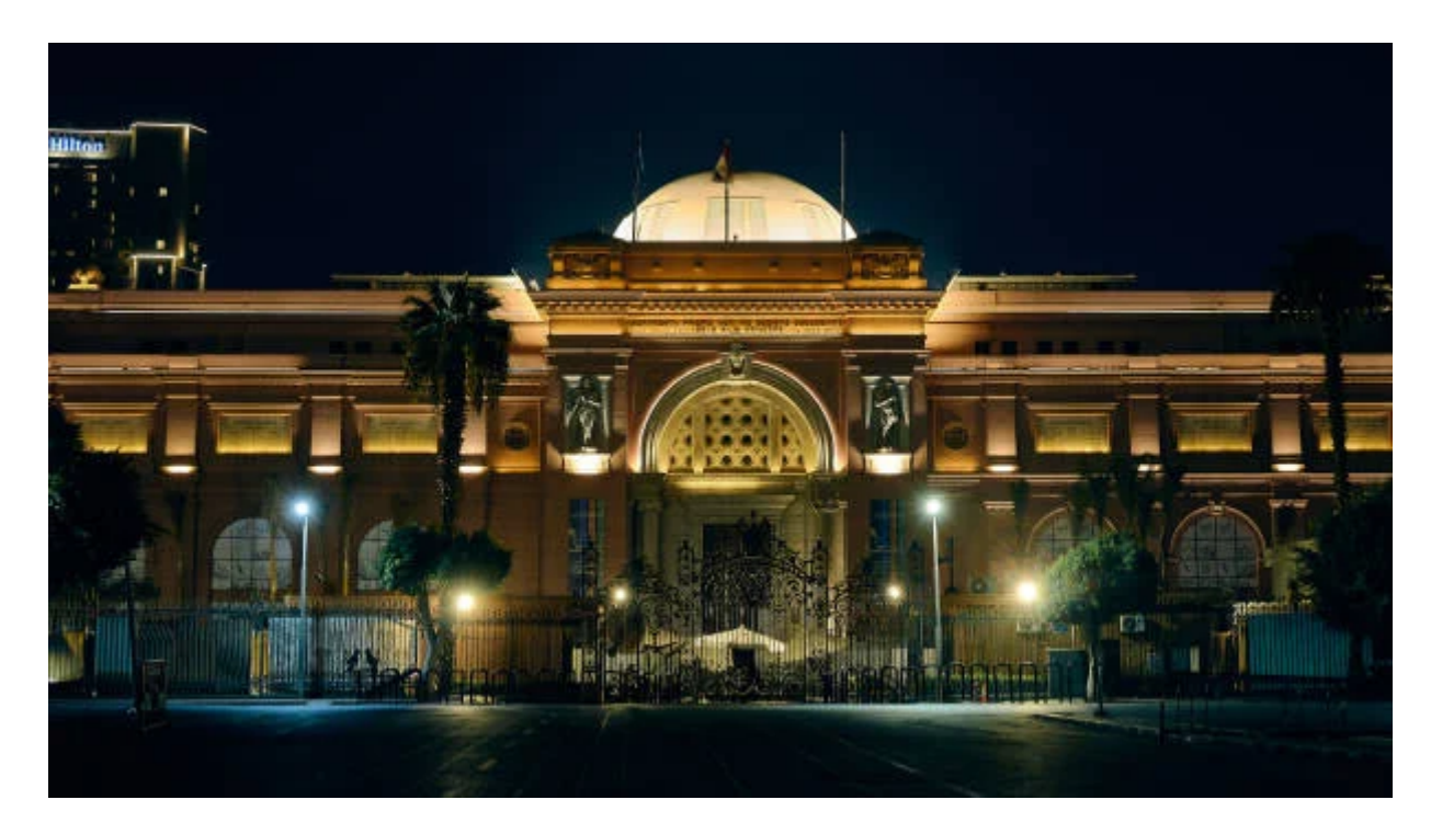
Giorno 4: Egyptian Museum , National Museum of Civilization , old Cairo

When you arrive at Cairo airport, our representative will take you to the hotel and the next day you will go to the Pyramids of Giza , then Saqqara , then Memphis and have lunch at a local restaurant