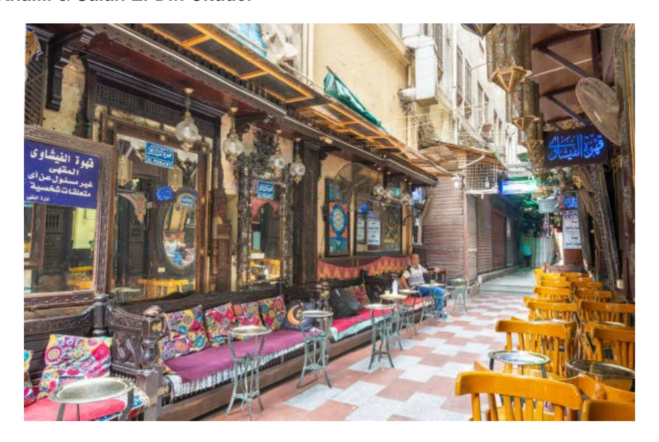
Giorno 5: Khan el-Khalili & Salah El-Din Citadel

When you get to the airport, we will transport you to our representative in an air-conditioned car so you can rest after a long day of travel to your Cairo hotel. The next morning, you may wake up after a peaceful night at our hotel. You will see Memphis , Saqqara , and the Giza pyramids with an expert tour after breakfast. Once this trip is over, we'll transport you to a nearby restaurant for lunch before dropping you off at your hotel , The next day, we will drive you to Alexandria to see the Qaitbay Citadel , where the Mamluk ruler had taken refuge in the late Mamluk era. In relation to the Pompey's Pillar , which is one of the Alexandrian Cemeteries ; in the evening, head back to the Cairo hotel to get ready for your visit to the Egyptian Museum , which has an extensive collection of antiquated artifacts; after that, head to the National Museum of Civilization , which leads to the church and the Jewish Temple , where you can learn about the nursery. After seeing the Coptic Museum , Coptic Plus goes to the Salah al-Din fortress and Khan Khalili Bazar , where leather, incense, and perfume are