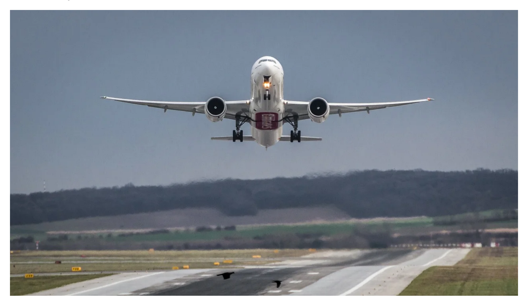
Giorno 5: Departure