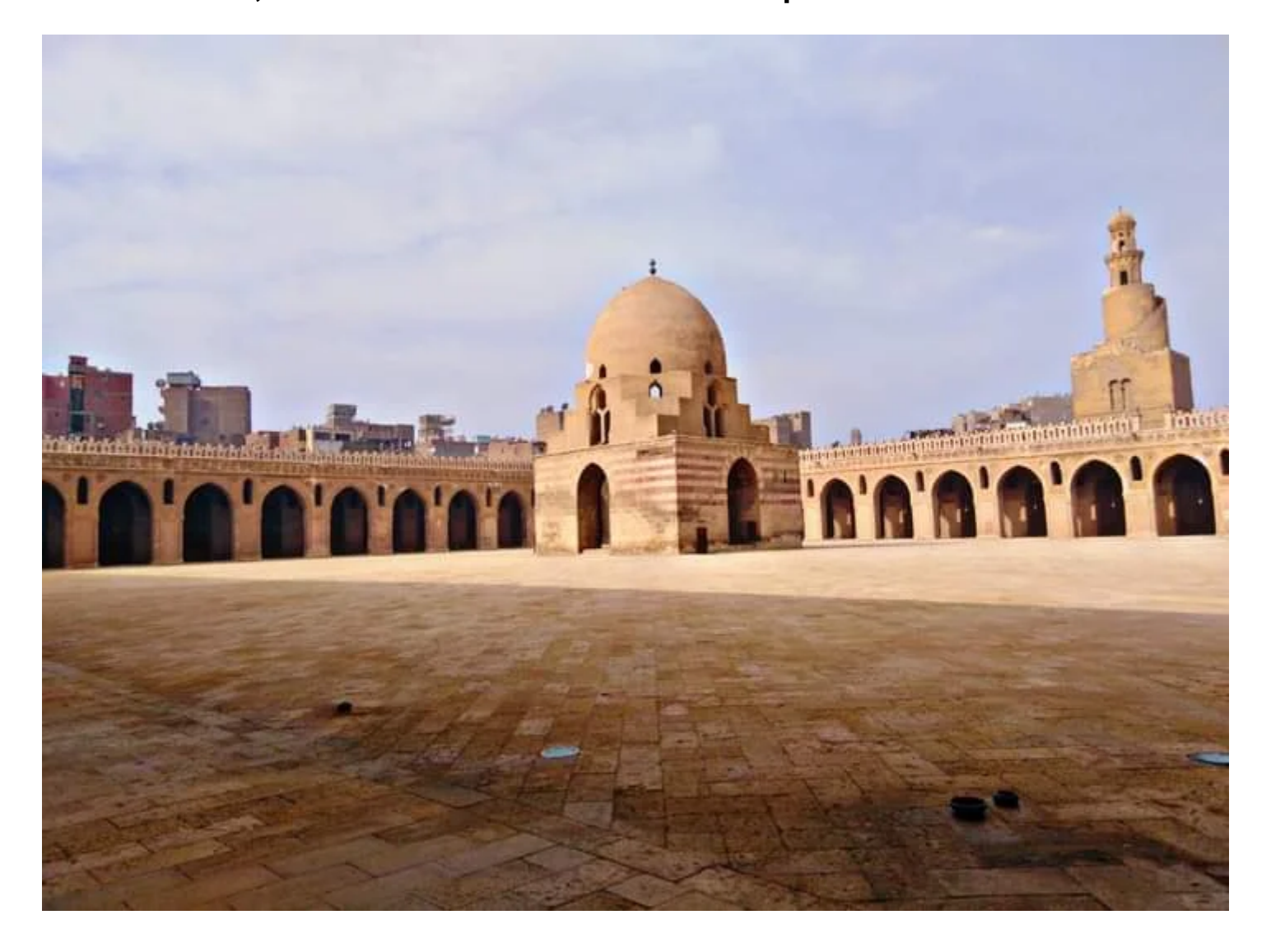
Giorno 4: Salah El-Din Citadel, Al-Sultan Hassan & Ibn Tulun Mosques