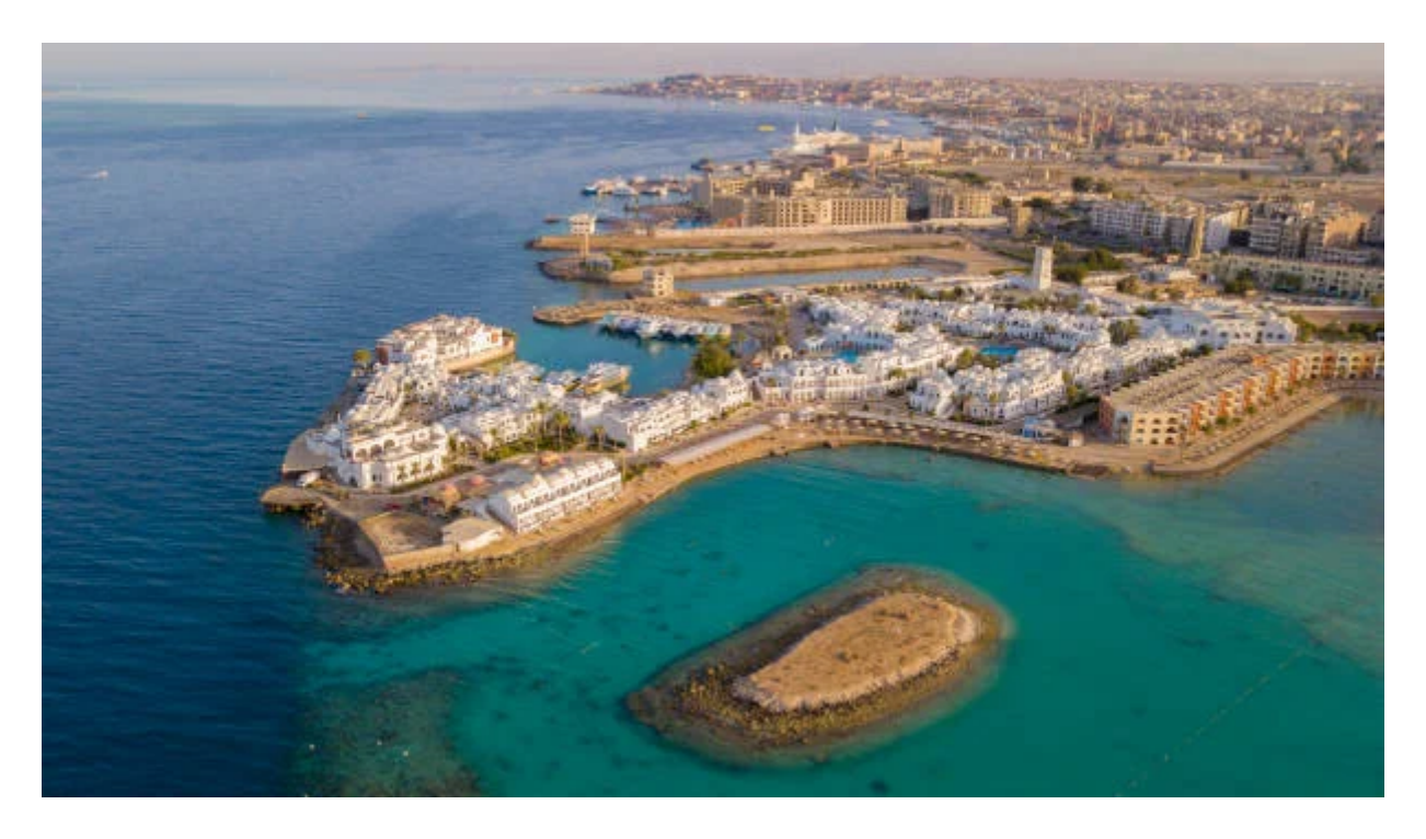
Jour 4: Fly to Hurghada