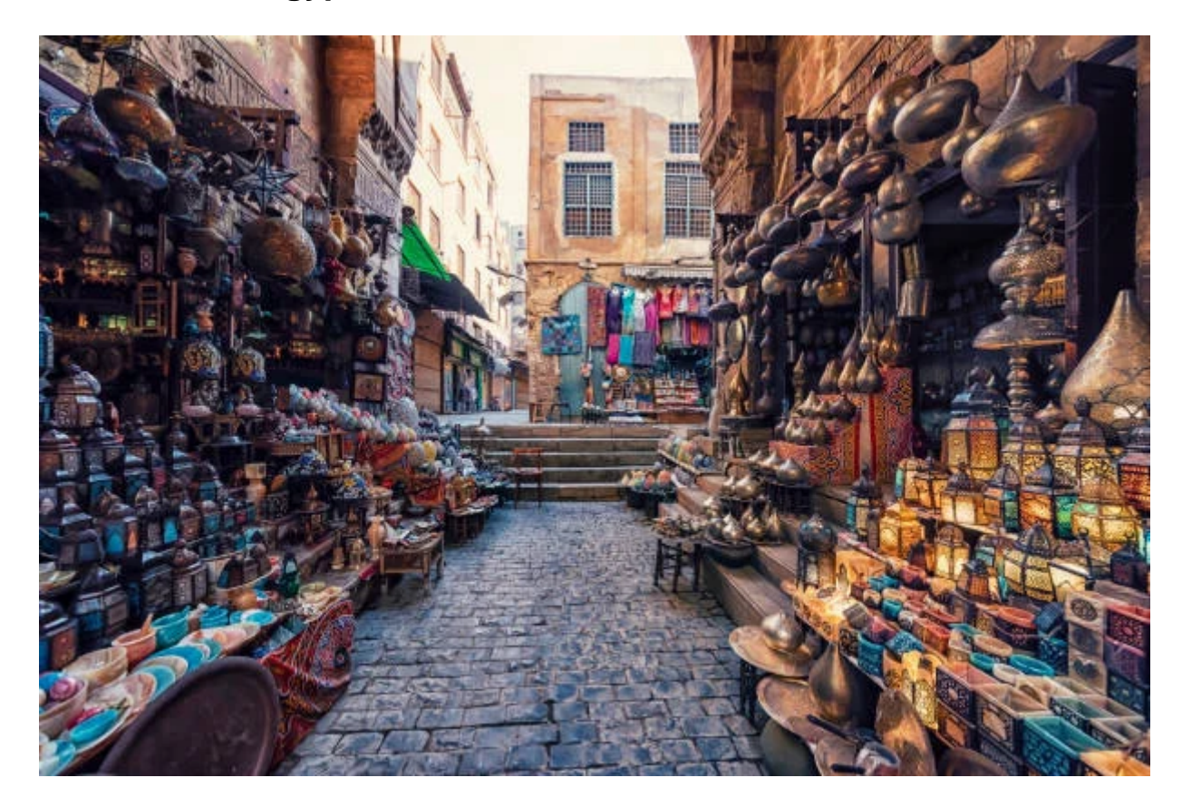
Jour 7: Fly back to Cairo , National Egyption Museum Khan El Khalili