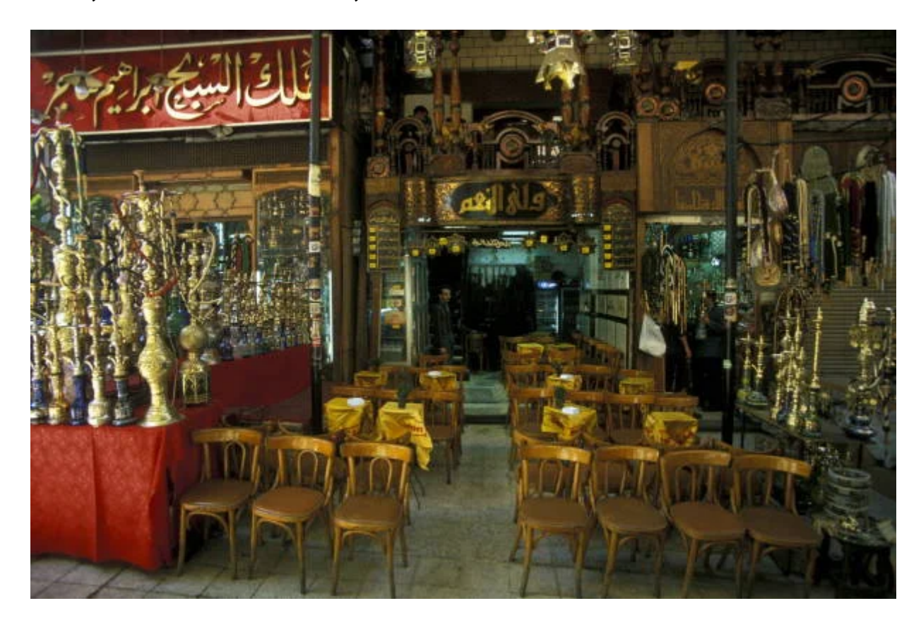
Jour 3: Egyptian Museum ,Salah El Din Citadel , Khan El Khalili

Once you arrive at the airport, our representative will receive and welcome you. Then you will go with him to the Pyramids of Giza , Saqqara , and Memphis . The next day, you will go to the Egyptian Museum , and then you will go to Salah El- Din Citadel and Khan El Khalili Bazar .