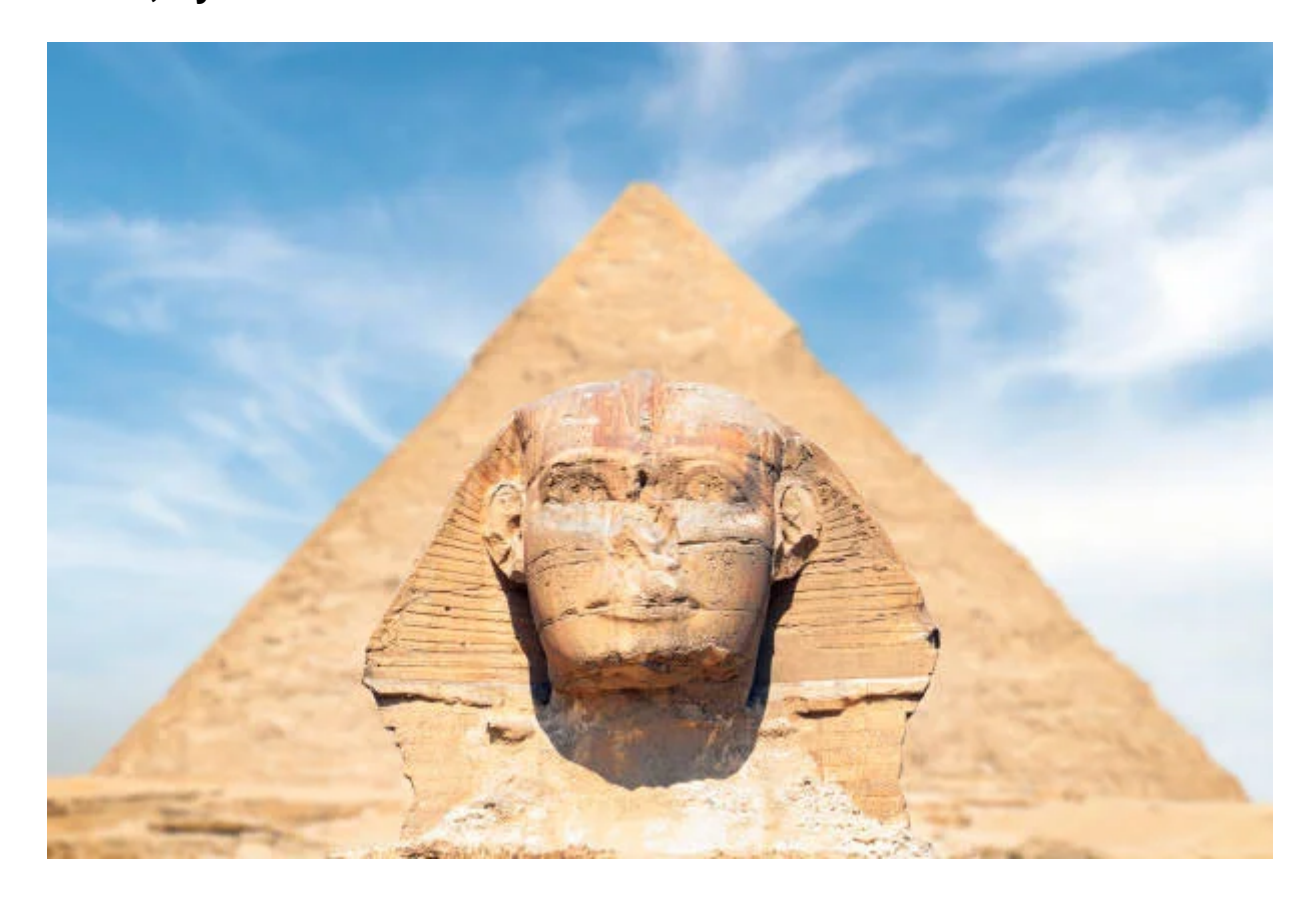
Jour 2: Memphis , Sakkara , Pyramids Tour

Once you arrive at the airport, our representative will receive and welcome you. Then you will go with him to the Pyramids of Giza , Saqqara , and Memphis . The next day, you will go to the Egyptian Museum , and then you will go to Salah El- Din Citadel and Khan El Khalili Bazar .