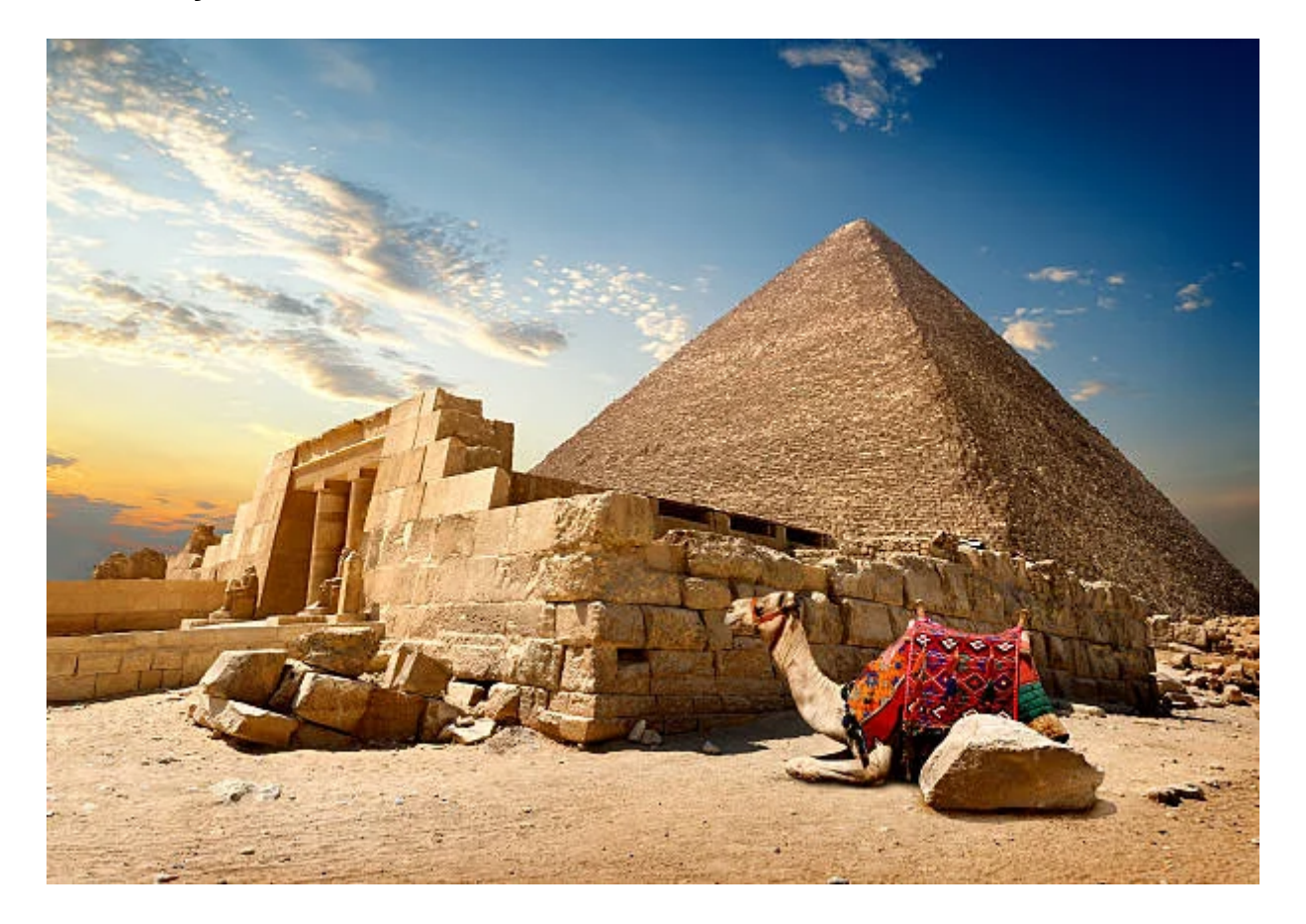
Jour 2: Memphis , Sakkara , Pyramids Tour

Once you arrive at the airport, our representative will receive and welcome you. Then you will go with him to the Pyramids of Giza , Saqqara , and Memphis . The next day, you will go to the Egyptian Museum , and then you will go to Salah El- Din Citadel and Khan El Khalili Bazar .