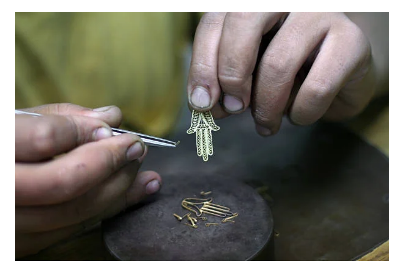
Jour 3: Egyptian Museum ,Salah El Din Citadel , Khan El Khalili

Once you arrive at the airport, our representative will receive and welcome you. Then you will go with him to the Pyramids of Giza , Saqqara , and Memphis . The next day, you will go to the Egyptian Museum , and then you will go to Salah El- Din Citadel and Khan El Khalili Bazar .