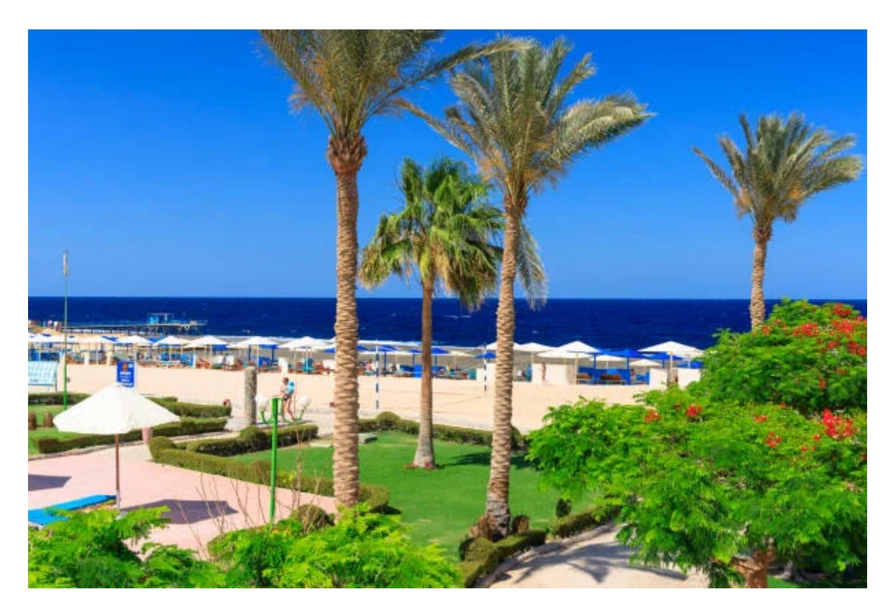
Jour 2: Fly to Marsa Alam