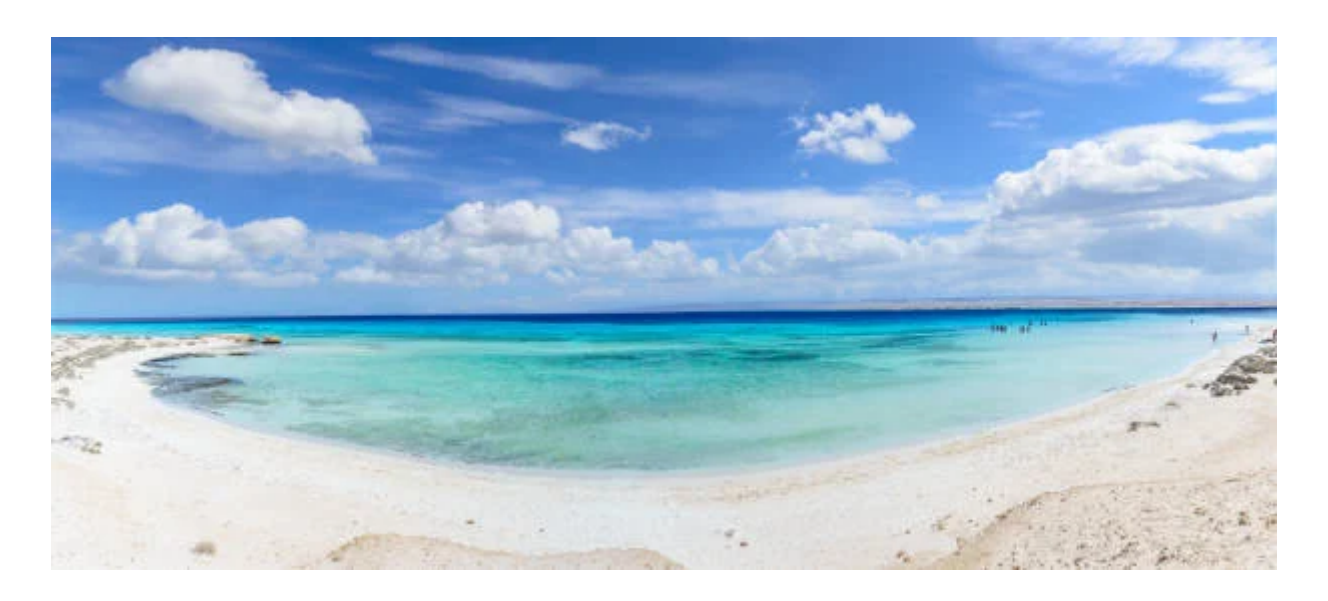
Jour 5: Marsa Alam