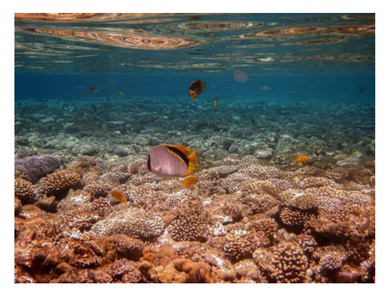
Jour 5: Hurghada