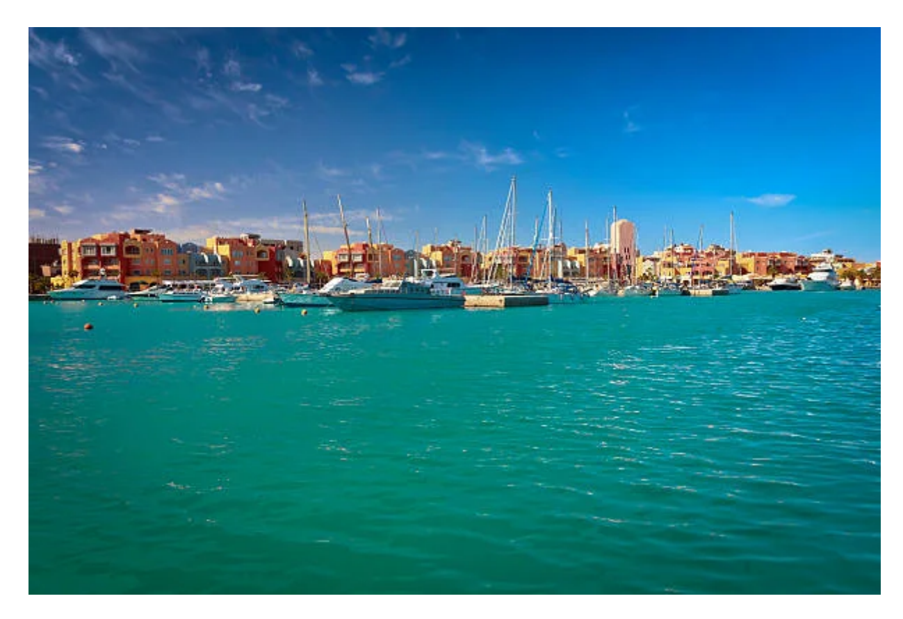
Jour 2: Fly to Hurghada