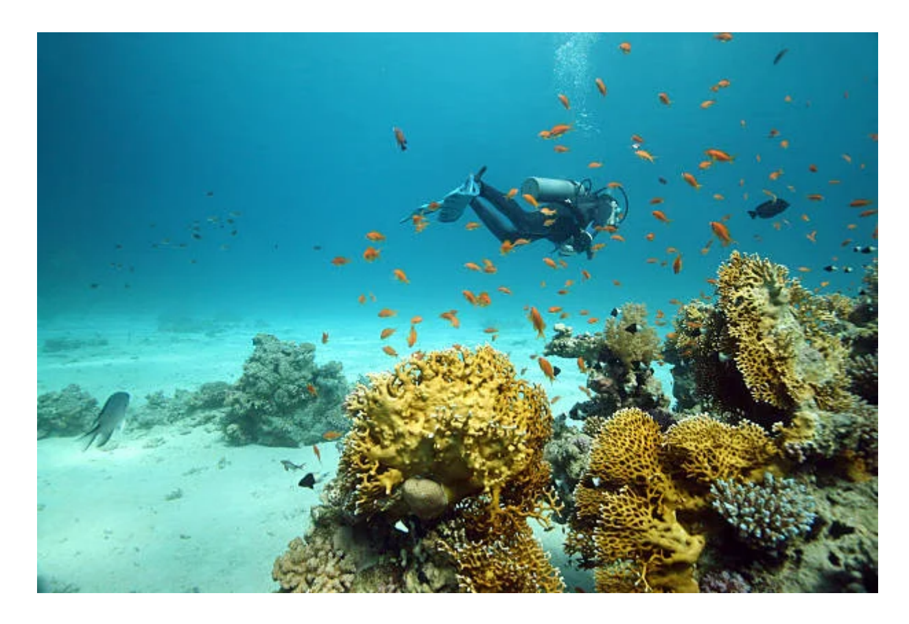
Jour 1: Arrival

Once you arrive at Cairo Airport, our representative will receive and welcome you, and then you will travel to Sharm El-Sheikh When you arrive at the airport, our representative will be waiting for you. He will take you in an air-conditioned car to go to your hotel to relax.