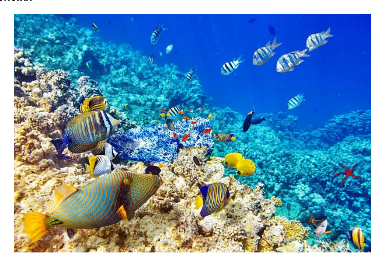
Jour 2: Shram El- Sheikh

Once you arrive at Cairo Airport, our representative will receive and welcome you, and then you will travel to Sharm El-Sheikh When you arrive at the airport, our representative will be waiting for you. He will take you in an air-conditioned car to go to your hotel to relax.