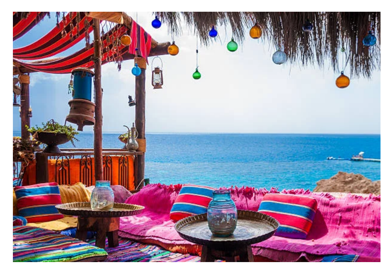
Jour 5: Fly to Sharm El Sheik

then on to Sharm El-Sheikh to spend some lovely relaxing time by the Sea Mediterranean.. When the skies are clear, you can enjoy many activities, including water skiing, diving, dolphin watching and more.