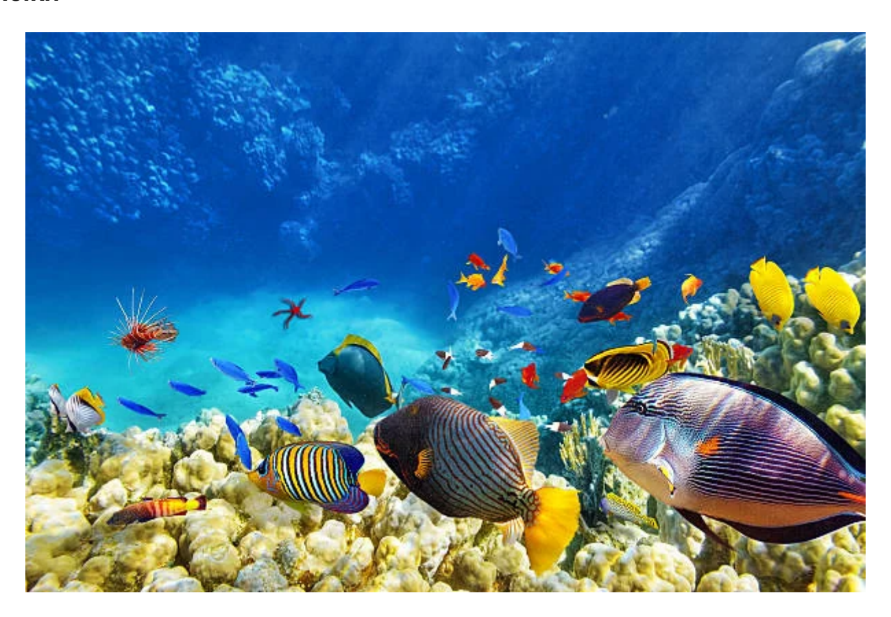
Jour 6: Sharm El Sheikh

then on to Sharm El-Sheikh to spend some lovely relaxing time by the Sea Mediterranean.. When the skies are clear, you can enjoy many activities, including water skiing, diving, dolphin watching and more.