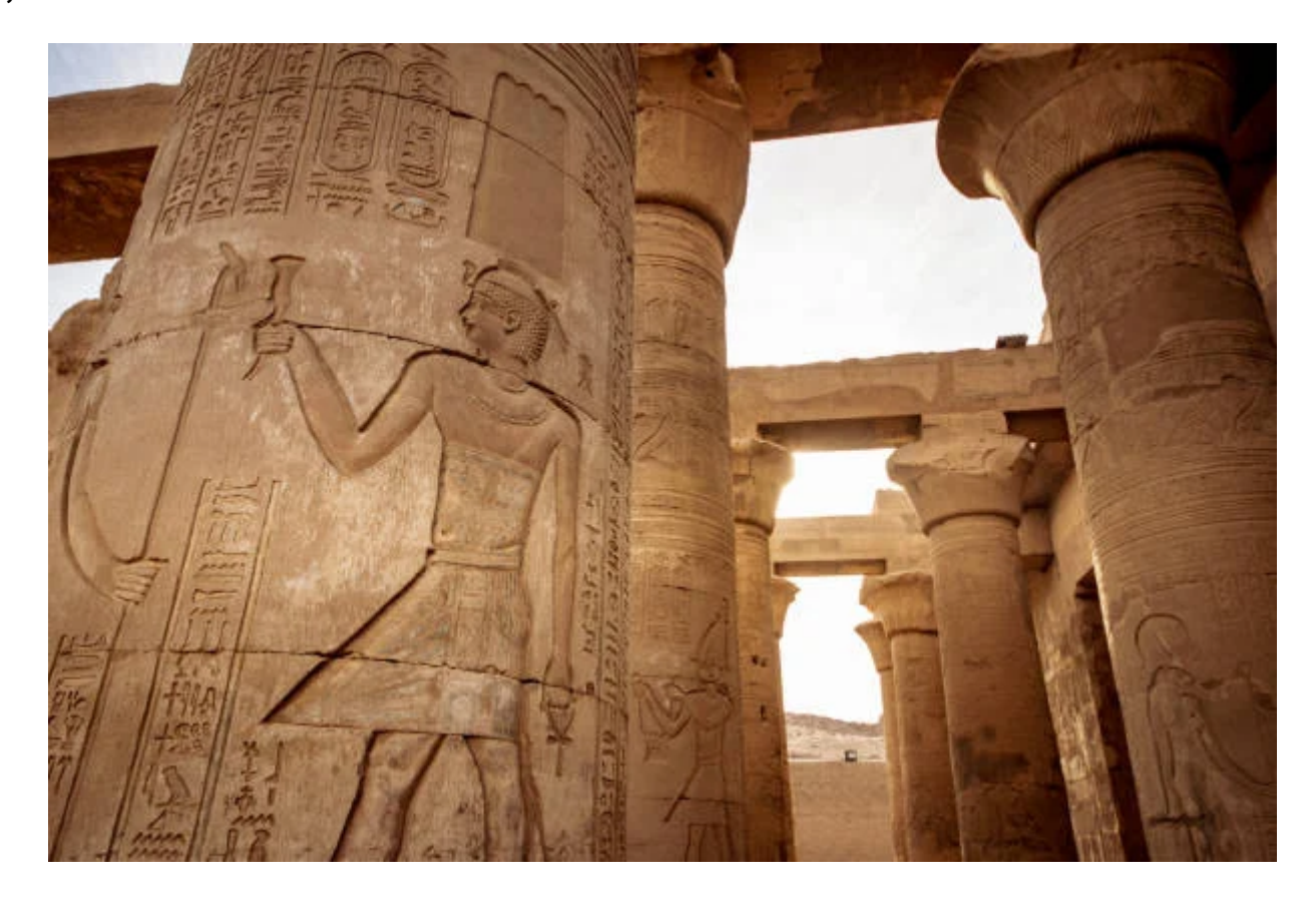
Jour 6: Kom Ombo, Edfu