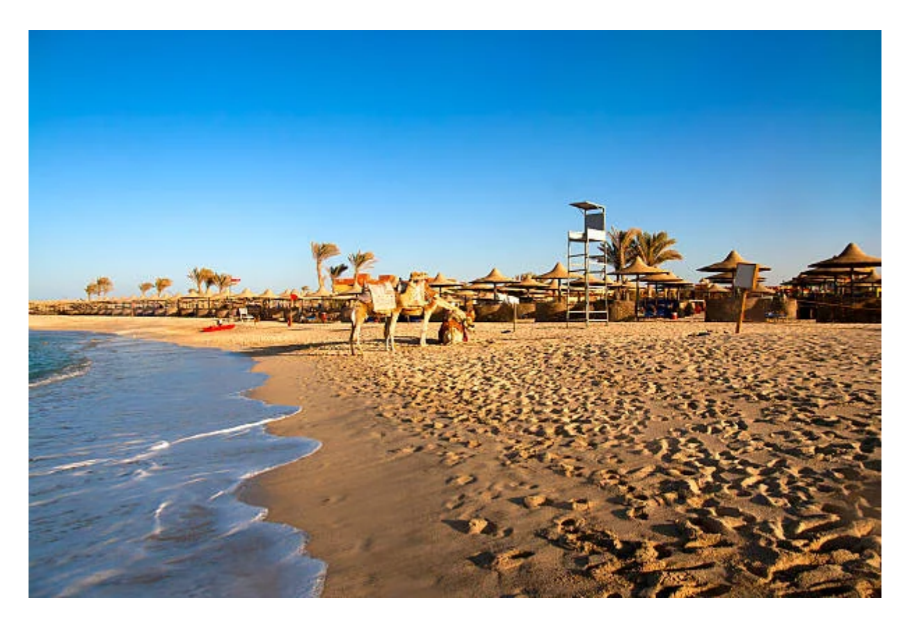
Jour 4: Fly to Marsa Alam

then on to Marsa Alam to spend some lovely relaxing time by the Sea Mediterranean.. When the skies are clear, you can enjoy many activities, including water skiing, diving, dolphin watching and more When you return to Cairo,