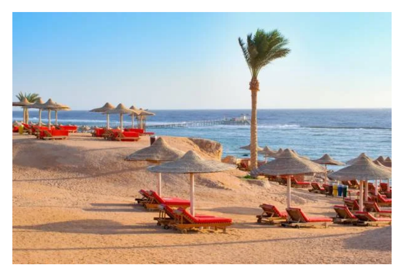
Jour 4: Fly to Marsa Alam

then on to Marsa Alam to spend some lovely relaxing time by the Sea Mediterranean.. When the skies are clear, you can enjoy many activities, including water skiing, diving, dolphin watching and more When you return to Cairo,