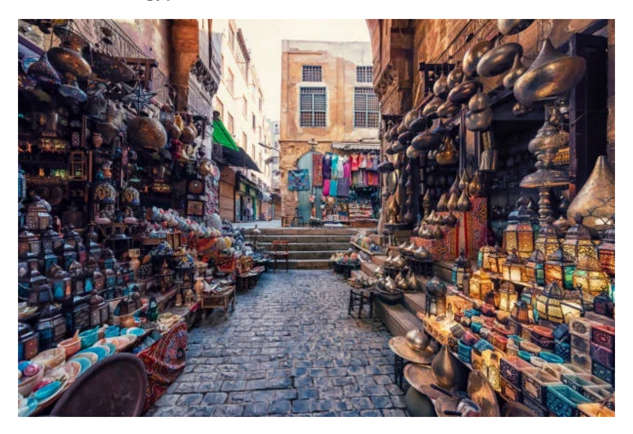
Jour 7: Fly back to Cairo, National Egyptian Civilization, Khan El Khalili

then on to Sharm El-Sheikh to spend some lovely relaxing time by the Sea Mediterranean.. When the skies are clear, you can enjoy many activities, including water skiing, diving, dolphin watching and more When you return to Cairo,