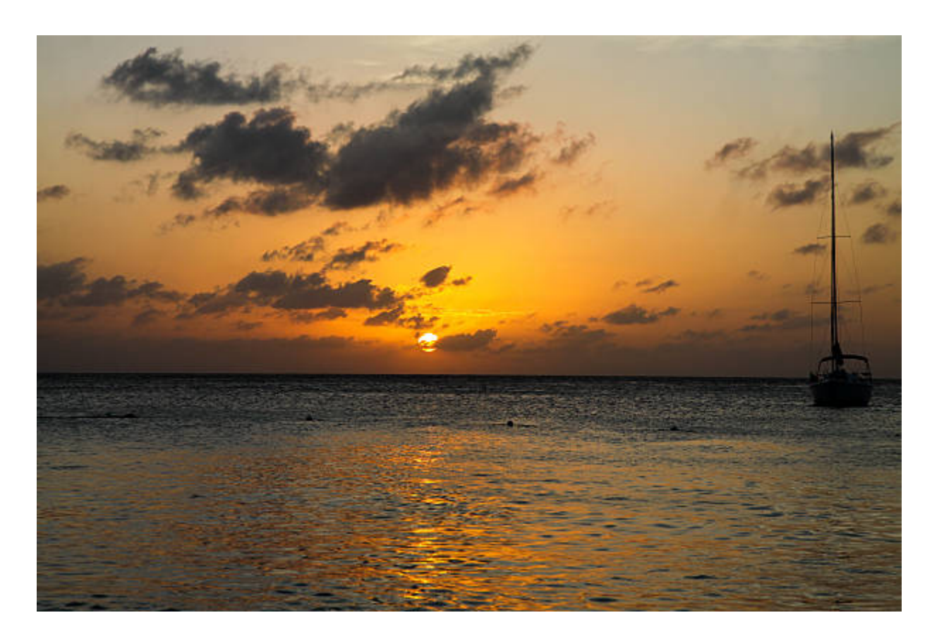
Jour 6: Hurghada