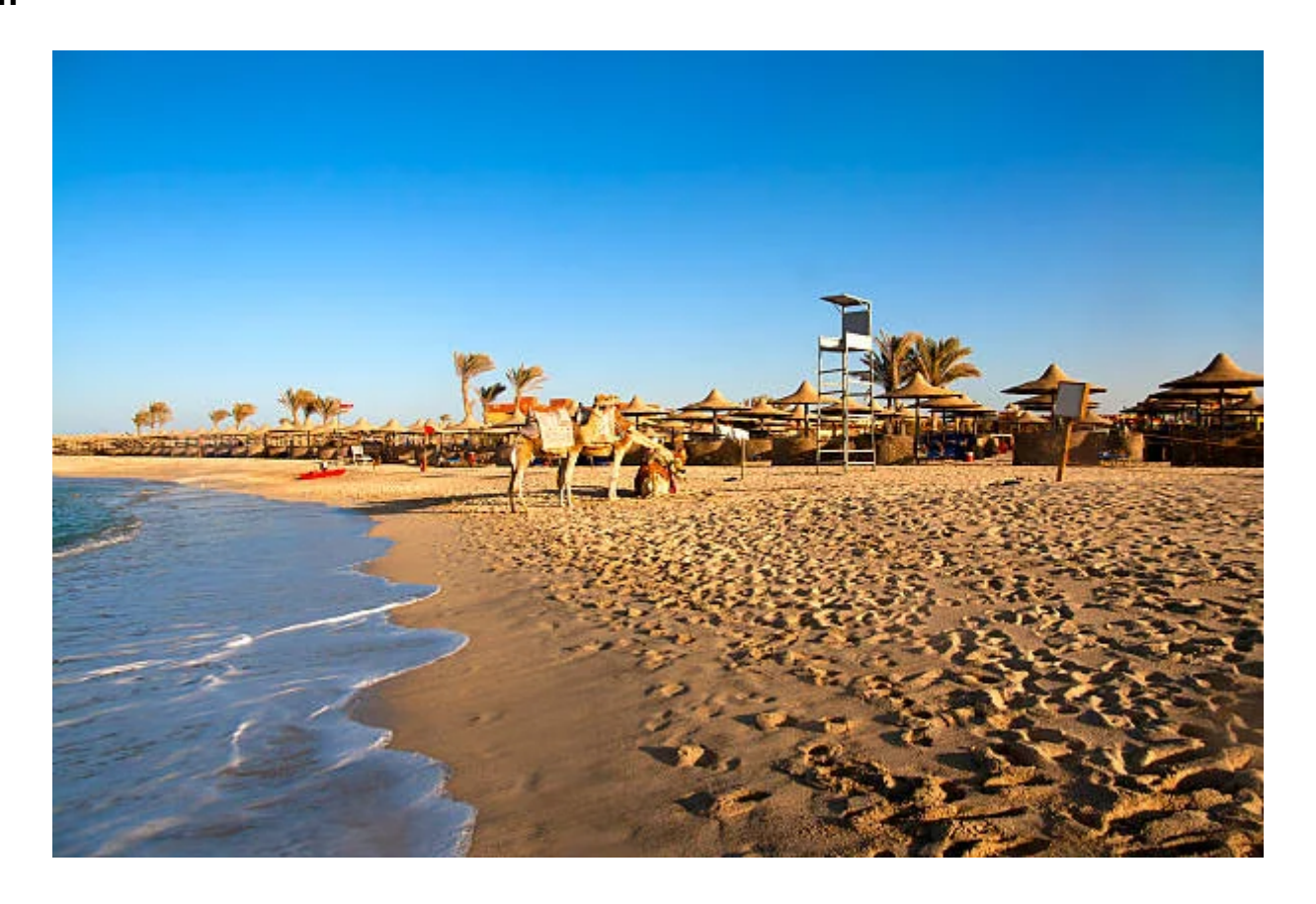
Jour 9: Marsa Alam