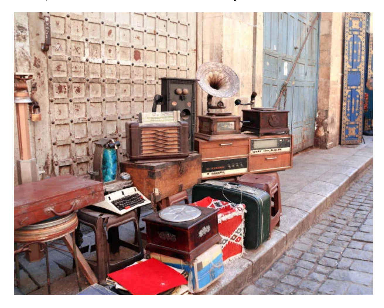
Jour 5: Salah El-Din Citadel, Al-Sultan Hassan & Ibn Tulun Mosques

Once you arrive at the airport, we will take you to our representative by air-conditioned vehicle from the airport to your hotel in Cairo to rest after a tiring day of travel. You can spend the night quietly at our hotel in the morning of the next day. After eating breakfast, you will go with a professional guide to the pyramids of Giza , the three pyramids of Sakkara , and Memphis . After enjoying this tour, we will take you to a local restaurant for lunch and return to your hotel. The next day, we will take you to Alexandria to visit the Citadel of Qaitbay , where the