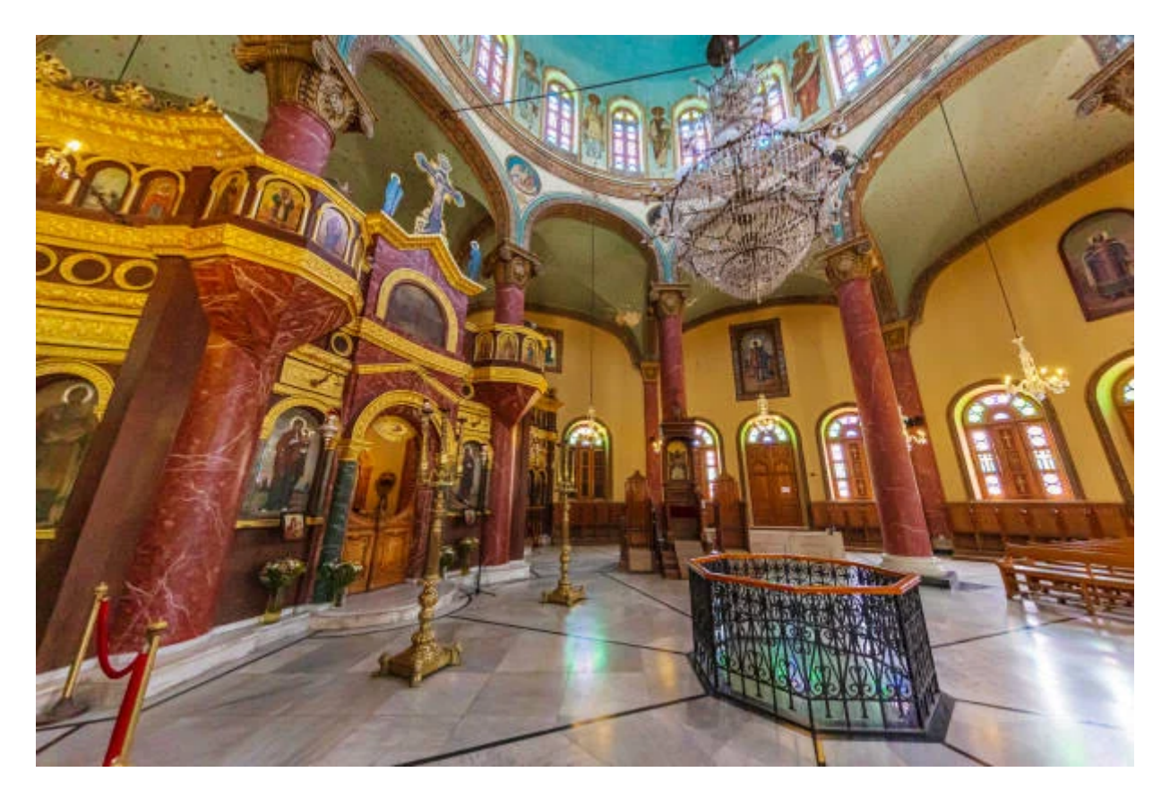
Jour 3: Egyptian Museum, National Museum of Civilization, Old Cairo

Once you arrive at the airport, we will take you to our representative by air-conditioned vehicle from the airport to your hotel in Cairo to rest after a tiring day of travel. You can spend the night quietly at our hotel in the morning of the next day. After eating breakfast, you will go with a professional guide to the pyramids of Giza , the three pyramids of Sakkara , and Memphis . After enjoying this tour, we will take you to a local restaurant for lunch and return to your hotel. The next day, we will take you to Alexandria to visit the Citadel of Qaitbay , where the king was in the late state of the Mamluks to protect them. To the pile of potsherds, which is one of the cemeteries in Alexandria, and in the evening, return to the hotel in Cairo to prepare to visit the Egyptian Museum , where there is a large collection of ancient relics, and then visit the National Museum of Civilization , which then takes you to the church and the Jews, where they learn about the nursery. Coptic Plus visits the Coptic Museum , and the next day reports to the Castle of Salah al-Din and then to the Khan El-Khalili Bazar where