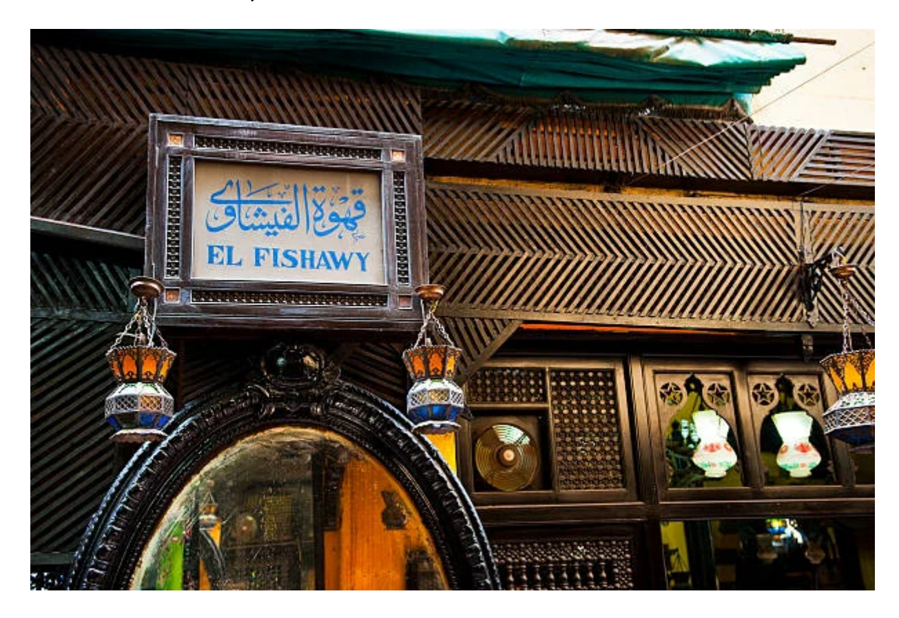
Jour 7: National Museum of Civilization, Khan El Khalili bazar

When you arrive at Cairo airport, you will meet our representative, Sera, who is air-conditioned, and go to your hotel and spend the night fun and quiet. The next day, you will go to the area of the pyramids of Giza and see the pyramids, the three, and the Sphinx , and then visit the pyramids of Saqqara , some after, and then we will take you to our representative for lunch, then return to your hotel to relax. The morning of the next day, after eating breakfast, we will take you to our delegates to visit the Egyptian Museum and Religions, the Hanging Church , and the Jewish Museum , Coptic, and then take a break to eat lunch on the fourth day of your trip. After breakfast, you will go on a four-hour trip into the white desert on After about 350 km, you will stop to have lunch and some refreshments, also known as the jewel of the desert, because it is a hill of crystal-like crystals where you can watch suitable exhilarating when the light hits it, then it will be used in horses in the desert and dinner in the camp, but enjoy watching the stars, and the next day you can enjoy a full day in health. White will use the location