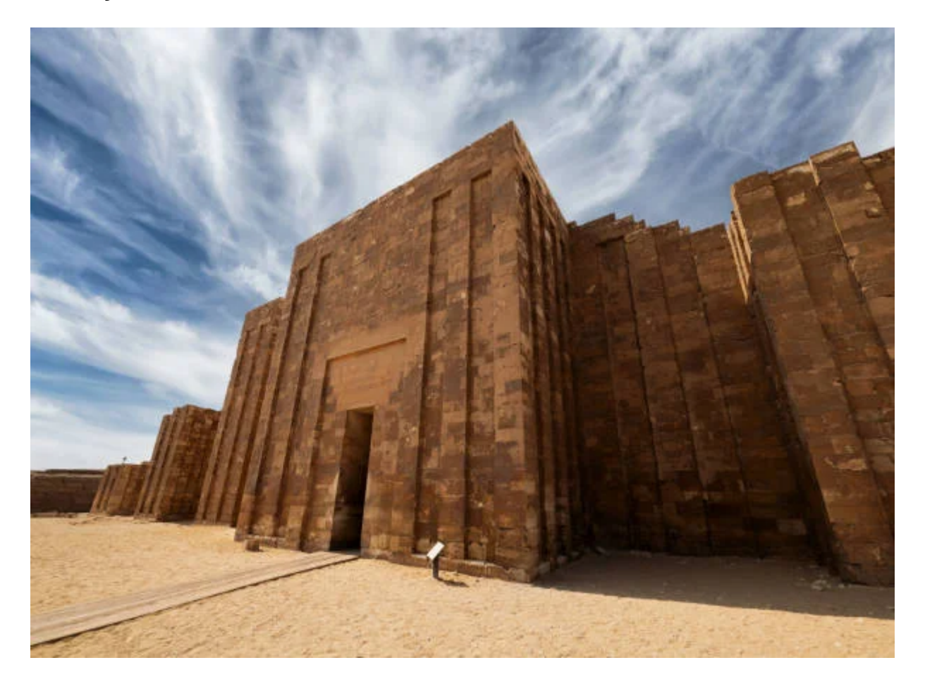
Día 2: Memphis, Sakkara, Pyramids Tour