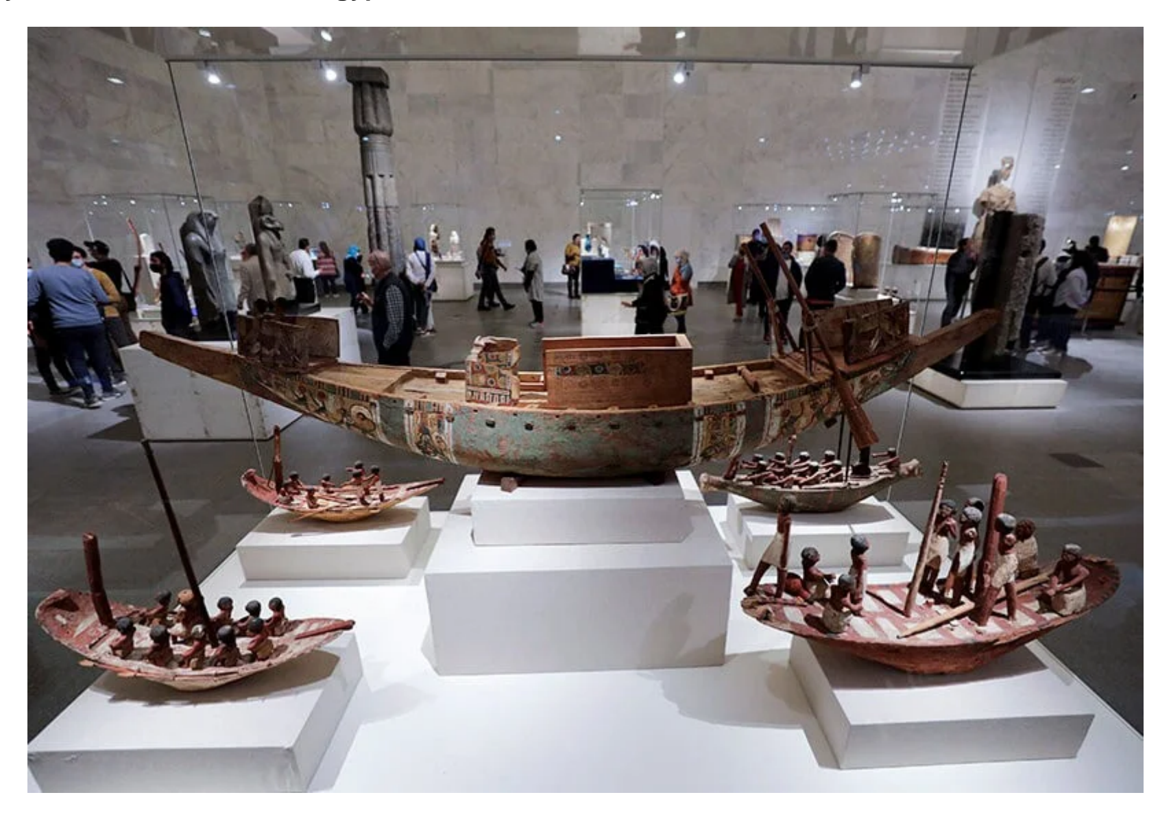
Día 7: Fly back to Cairo , National Egyptian Museum , Khan El Khalili