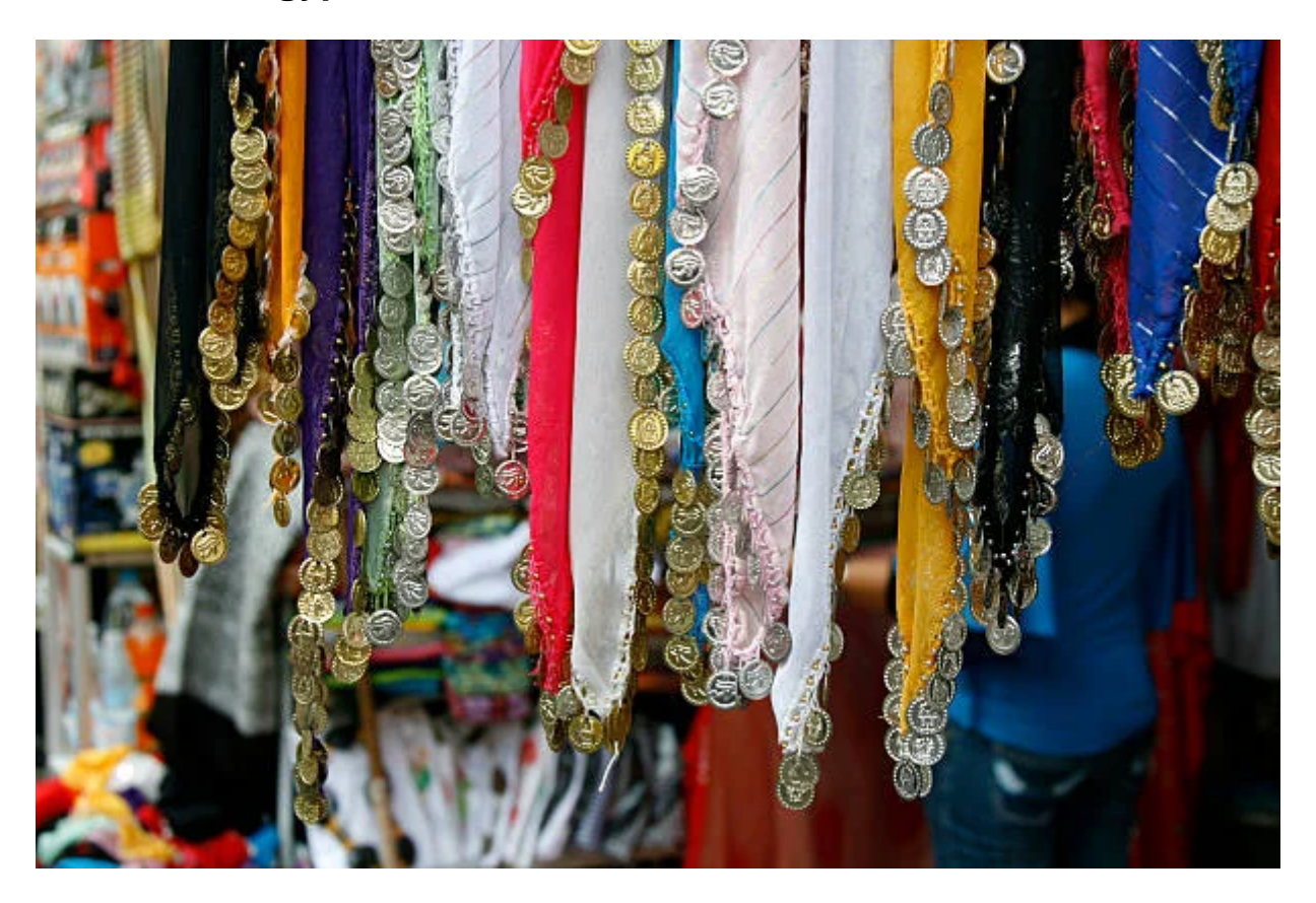
Día 7: Fly back to Cairo, National Egyptian Civilization, Khan El Khalili