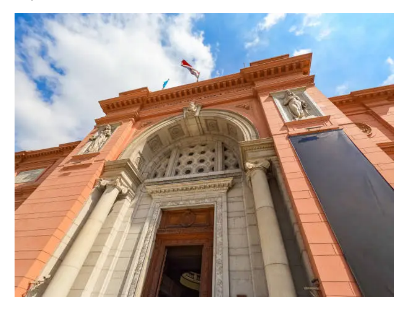
Día 4: Egyptian Museum, Old Cairo