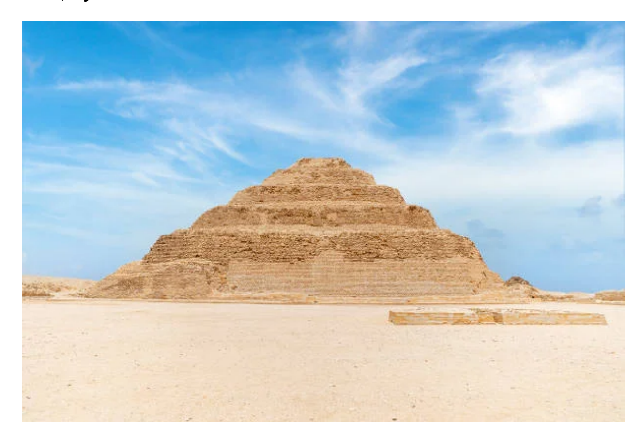
Día 2: Memphis, Sakkara, Pyramids Tour