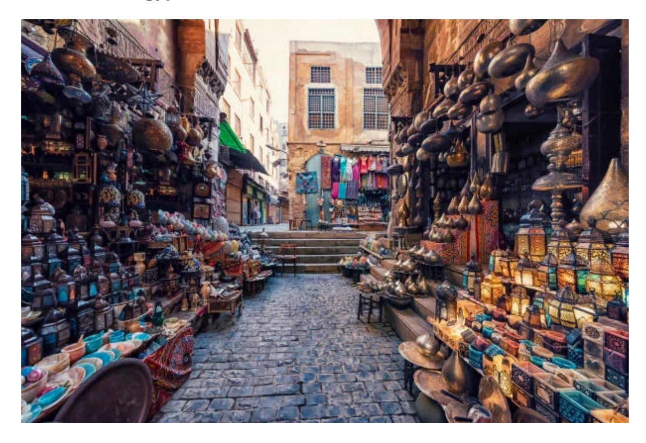
Día 7: Fly back to Cairo , National Egyption Museum Khan El Khalili