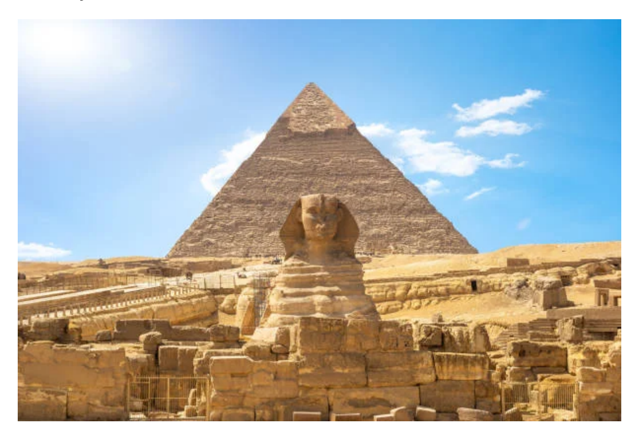
Día 7: Memphis, Sakkara, Pyramids Tour

Our representative will receive you from the airport carrying a banner bearing your name. After welcoming you at the airport, he will take you to a hotel in Cairo. The next day, you will go to Marsa Alam and enjoy the beaches of Marsa Alam . You can do many activities. The next day, you will go on a safari tour with our representative, and after spending two days in... Marsa Alam You will continue the rest of your trip in Cairo. Your trip will begin by visiting the Egyptian Museum a nd, in the evening,