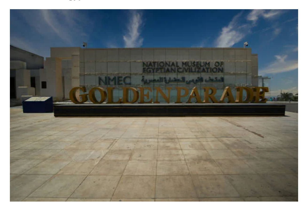
Día 6: Fly beck to Cairo , National Egyptian Civilization , Khan El Khalili

Our representative will receive you from the airport carrying a banner bearing your name. After welcoming you at the airport, he will take you to a hotel in Cairo. The next day, you will go to Marsa Alam and enjoy the beaches of Marsa Alam . You can do many activities. The next day, you will go on a safari tour with our representative, and after spending two days in... Marsa Alam You will continue the rest of your trip in Cairo. Your trip will begin by visiting the Egyptian Museum a nd, in the evening,